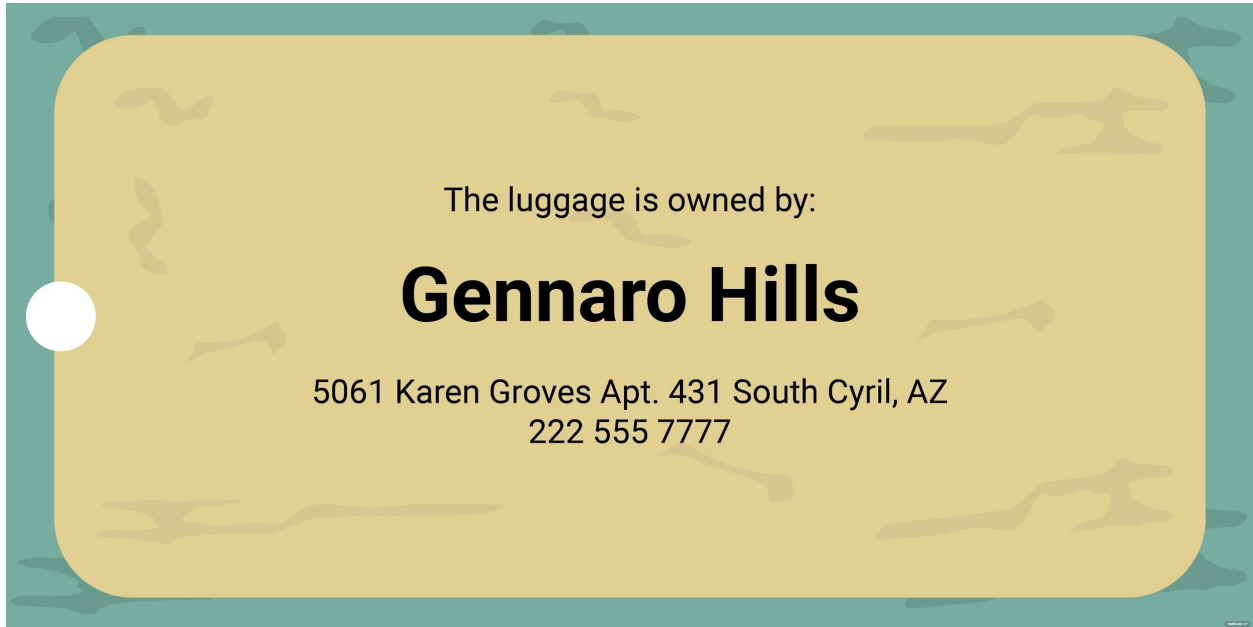
Photo Luggage Tag

Vintage luggage tags are made for those who love vintage aesthetics. Their designs are fairly simple and functional as they clearly highlight the name, address, and contact details of the luggage owner. Vintage luggage tags mostly have bright colors and fewer decorations sprinkled all over their layout.