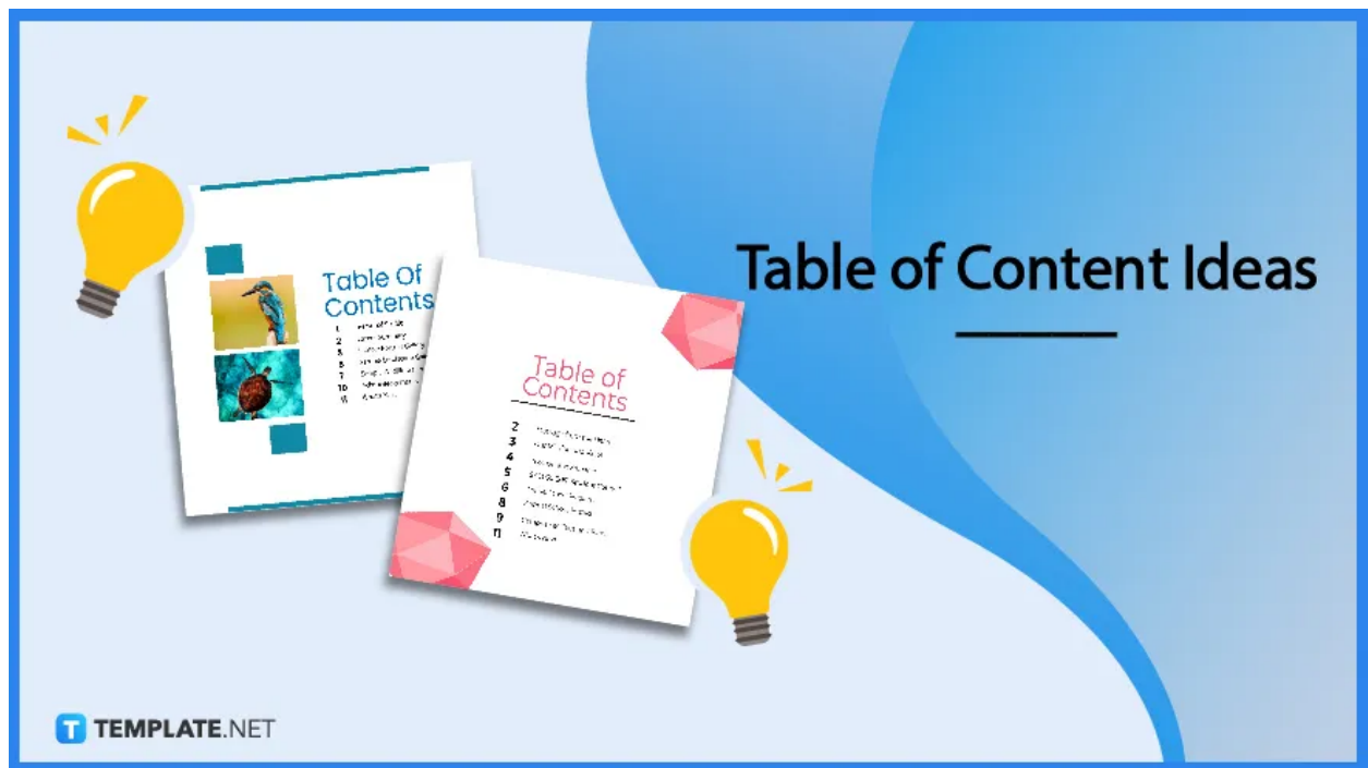
Table of contents can look different based on the kind of writing it precedes. Here are some design ideas and examples you can check out to make your table of contents creative and professional.