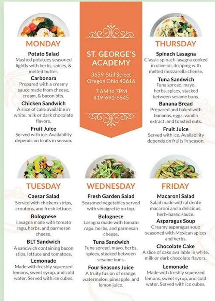
Table Tent Uses, Purpose, Importance