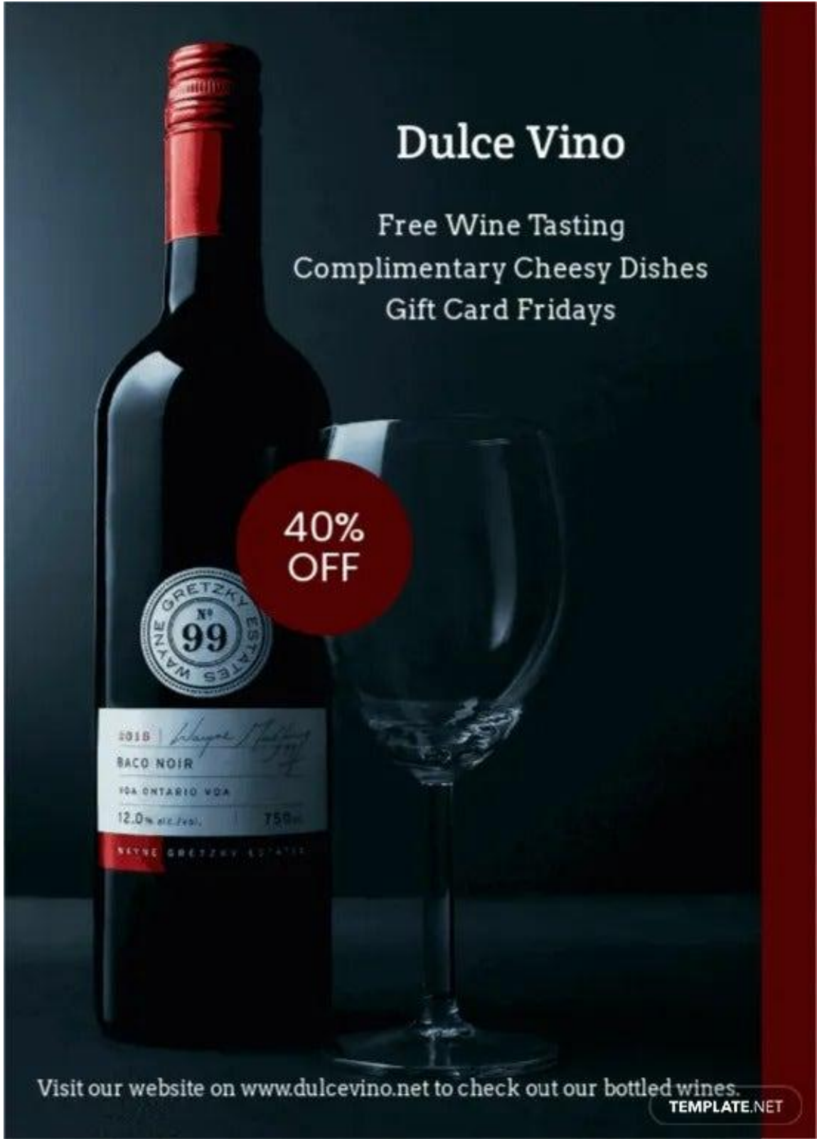
Pizza Table Tent