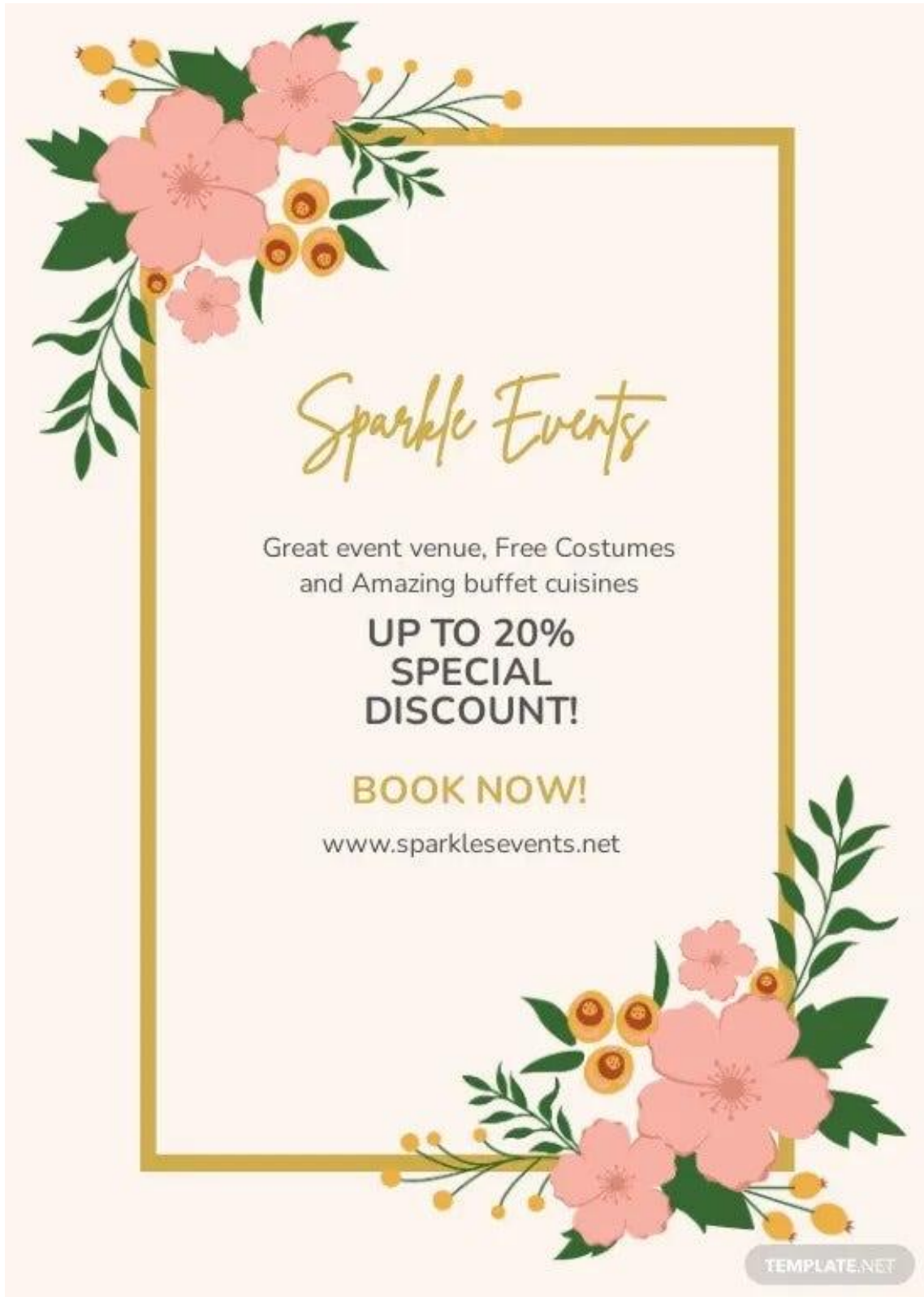
School Table Tent