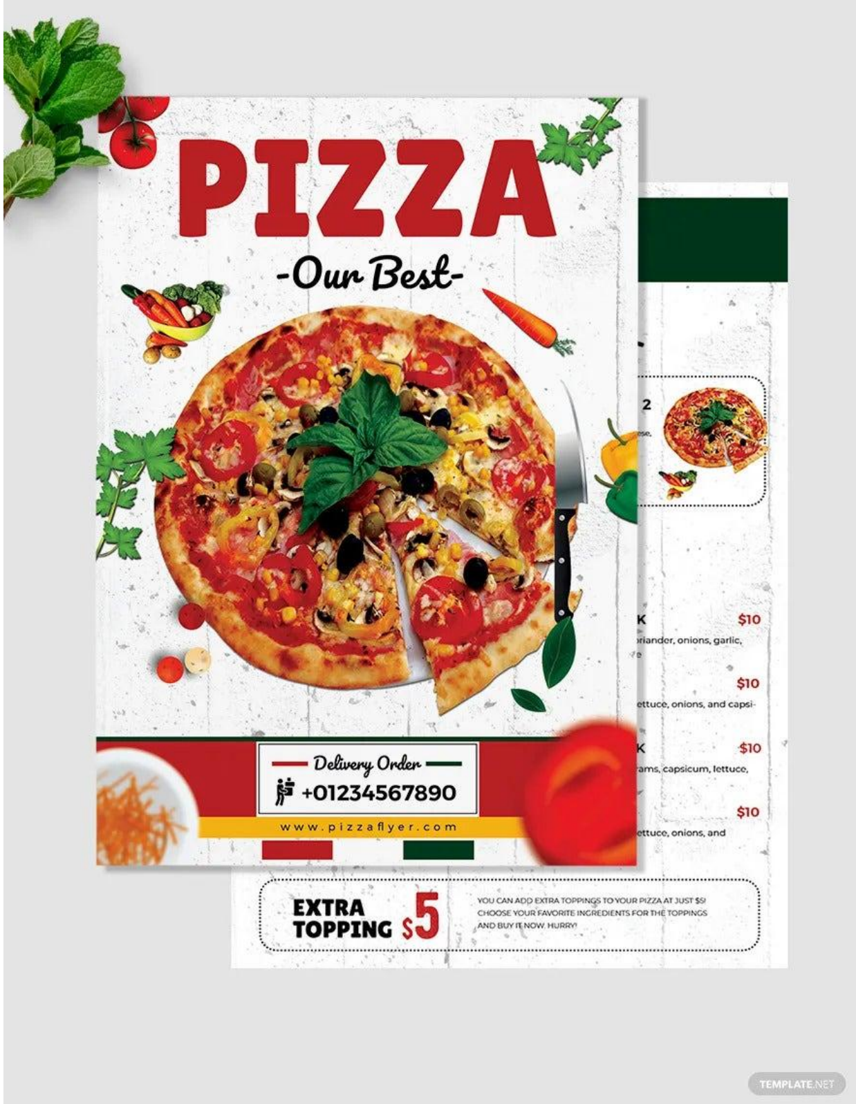
Concert Table Tent