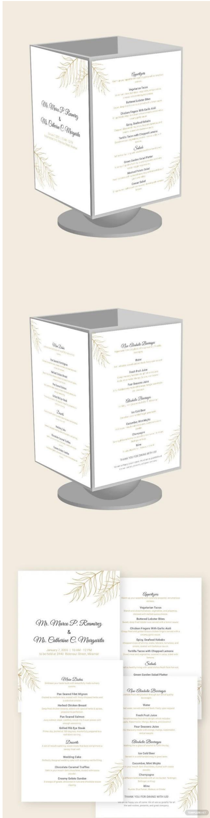
Wine Table Tent