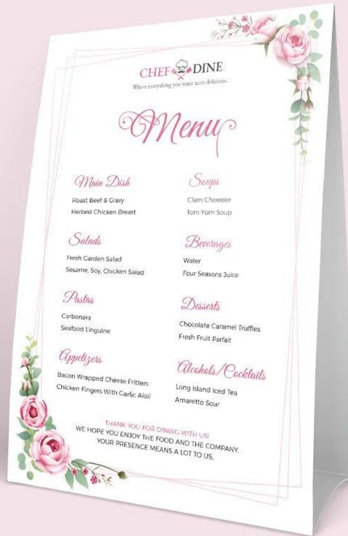
Card Table Tent