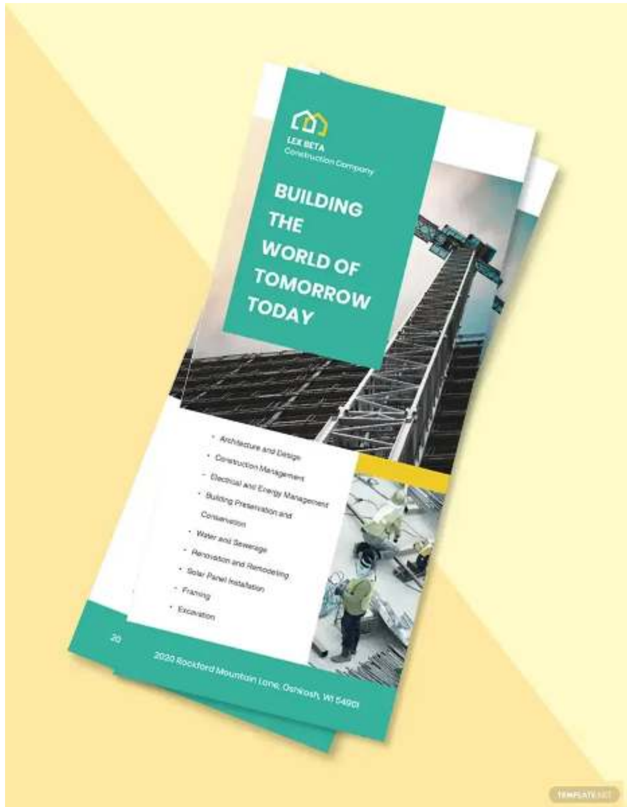
Wedding Rack Card