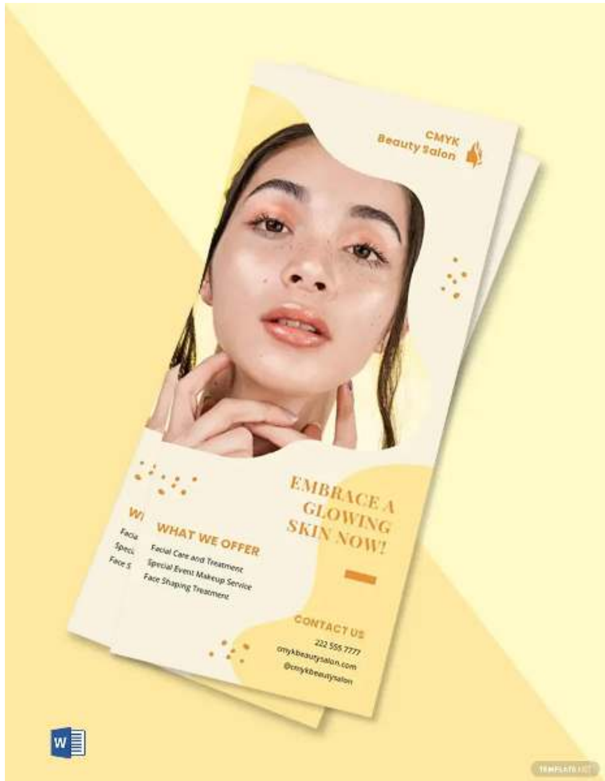
Marketing Rack Card