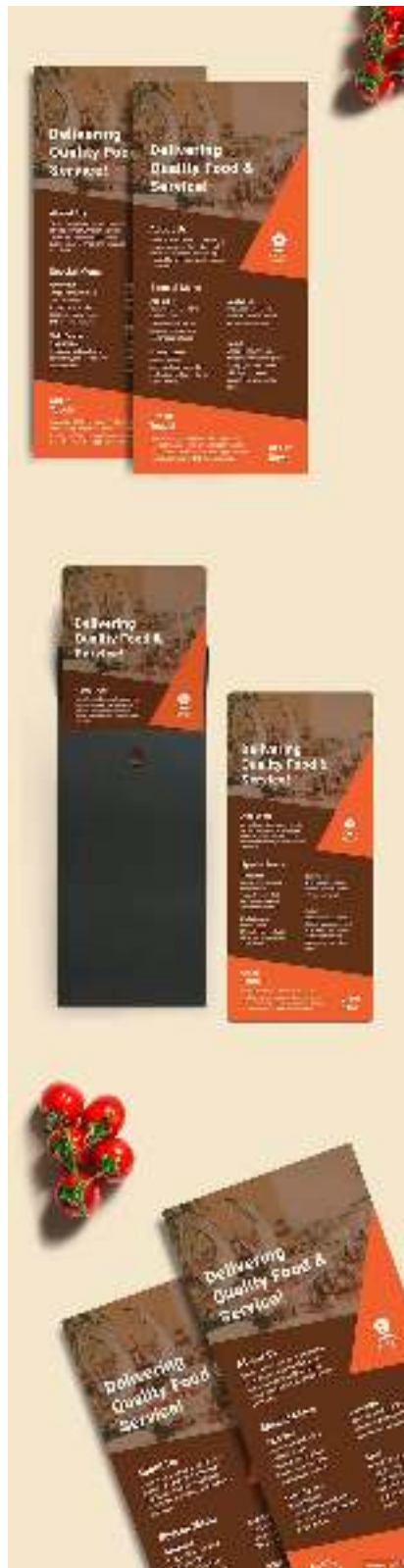
Beauty Rack Card