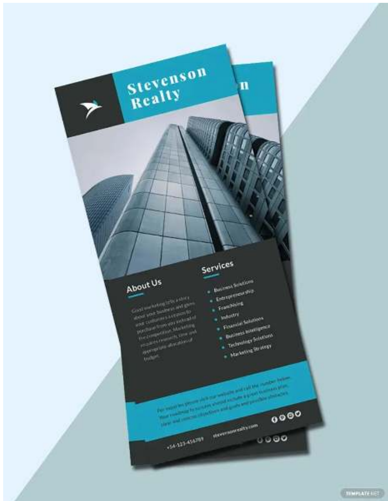
Restaurant Rack Card