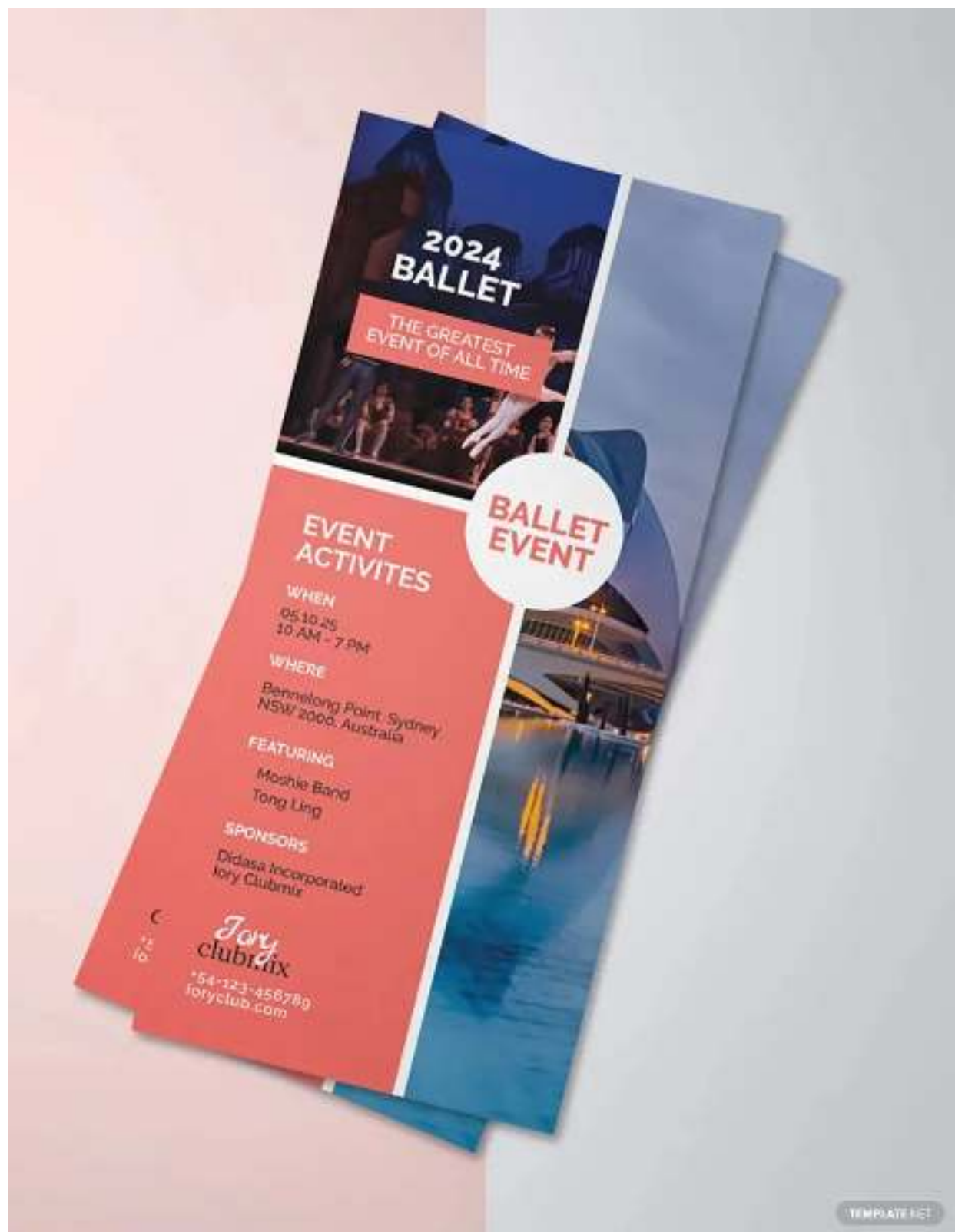
Church Rack Card