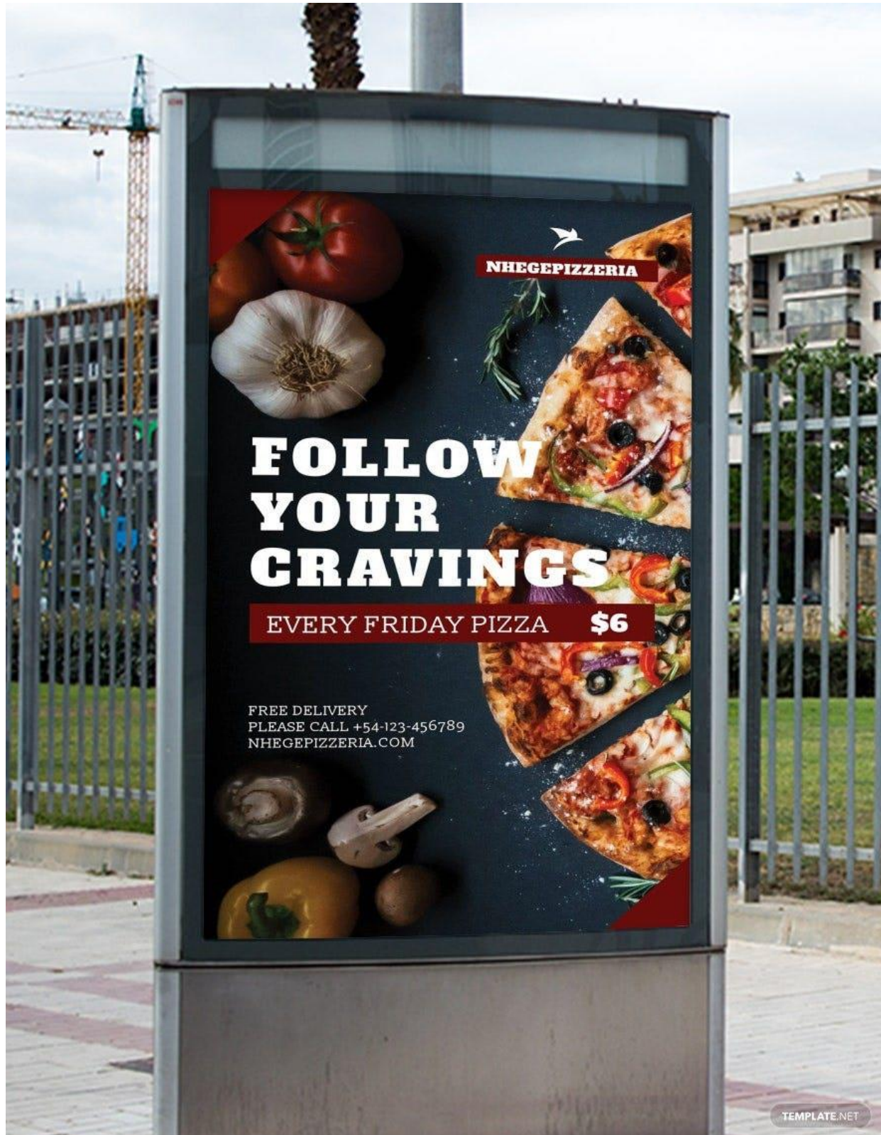
Company Digital Signage