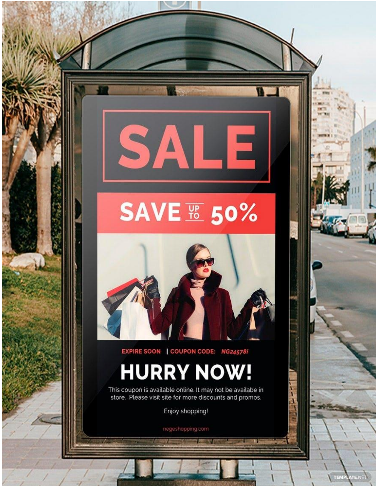
Christmas Digital Signage