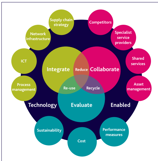
Figure 3: ICE model for managing product returns (Bernon and Cullen, 2007)

The ICE model provides a way forward for managing product returns. At the centre of the approach is a hierarchy of product disposition (Carter and Ellram (1998):