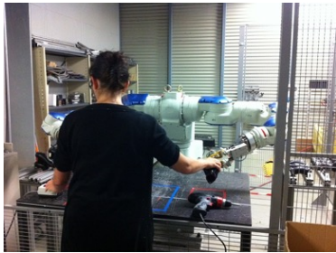
Fig. 6. Human Robot Cooperation Study. Real Environment.