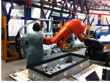
Fig. 4. Human Robot Copresence Study. Real Environment.