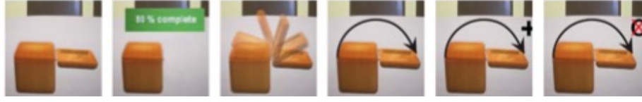
Fig. 3. Study of gesture feedback : on a box opening task, the gesture is measured and several visual feedbacks are proposed to the user (from left to right : boolean, textual, steps, normal, enhanced, openloop) and compared in terms of gesture completion and proximity to an initially recorded natural gesture

We compared descriptors of gestures between an initially recorded natural gesture (done with no feedback constraints), and the gestures performed with the feedbacks. Results showed firstly that the non coupled feedback is immediately recognized as such, and gesture descriptors greatly differ from initial gesture (small movements, shorter time). Mechanical work and completion time are also different for all feedbacks. Finally the subjective preferences of users went to enhanced feedback, and diminish with for lower levels of information. In a second experiment, we studied the role of affordances on gesture memorization. We have shown that affordances, which is the visual appearance of objects that shows how it is operated, increase user recall of gestures.