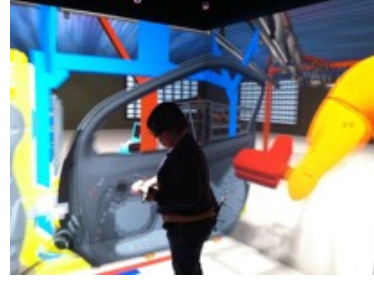
Fig. 5. Human Robot Copresence Study. Virtual Environment.