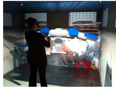
Fig. 7. Human Robot Cooperation Study. Virtual Environment

between real and virtual environments. A increase in heart rate was found when the robot was close, in both real and virtual conditions. Finally, a skin conductance raise (that may be representative of user stress) when the robot was close, in the real conditions, was not found in the virtual condition. In the cooperation scenario, the main result is again that the questionnaires get close responses between real and virtual conditions (acceptability, perceived security, usability). And we observe the same trends on physiological measures as for the copresence use case. We can hypothesize that more complete feedbacks (such as haptics providing contact information with the environment, or auditory feedback for factory or simulated robot sounds) may increase ecological validity, but these require specific studies.