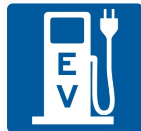
Alternate Electric Vehicle Charging Symbol sign (D9-11b Alternate)

The vendor must coordinate with the California Department of Transportation "Caltrans" to have directional signage produced and installed along the Highway. The symbol signs, D9-11b (alternate), must meet MUTCD standards and be placed along the roadways at the exit approaches and on the off-ramps. The vendor shall coordinate with cities and counties on follow-through signage on local roads leading to the charging location. See www.westcoastgreenhighway.com/evsigns.htm for sign specifications.