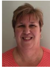
Kim Kloack Hunt Elementary