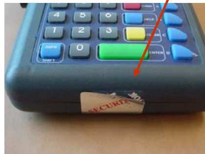
Figure 5C: After removal of security seal.