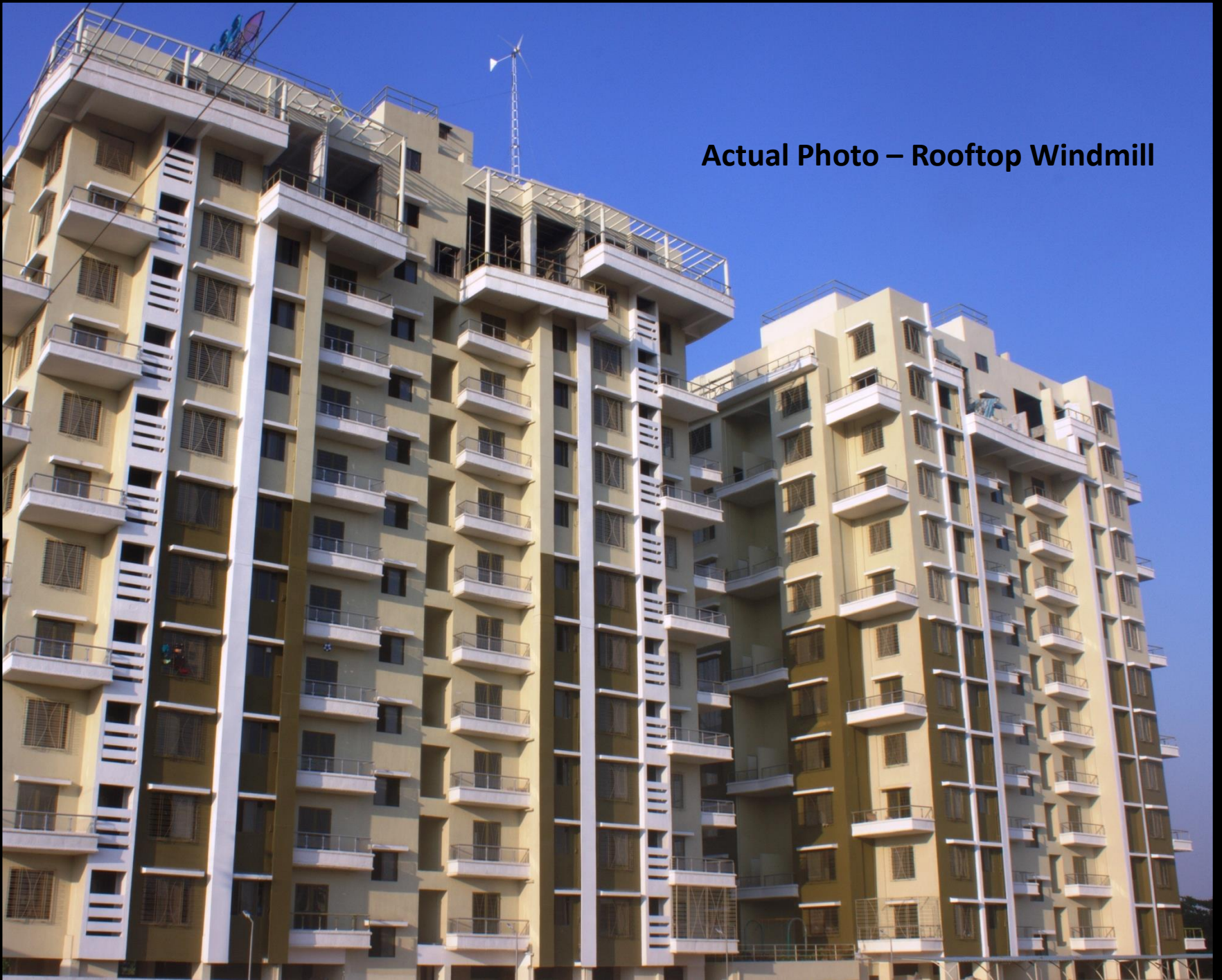
Actual Photo – Rooftop Windmill