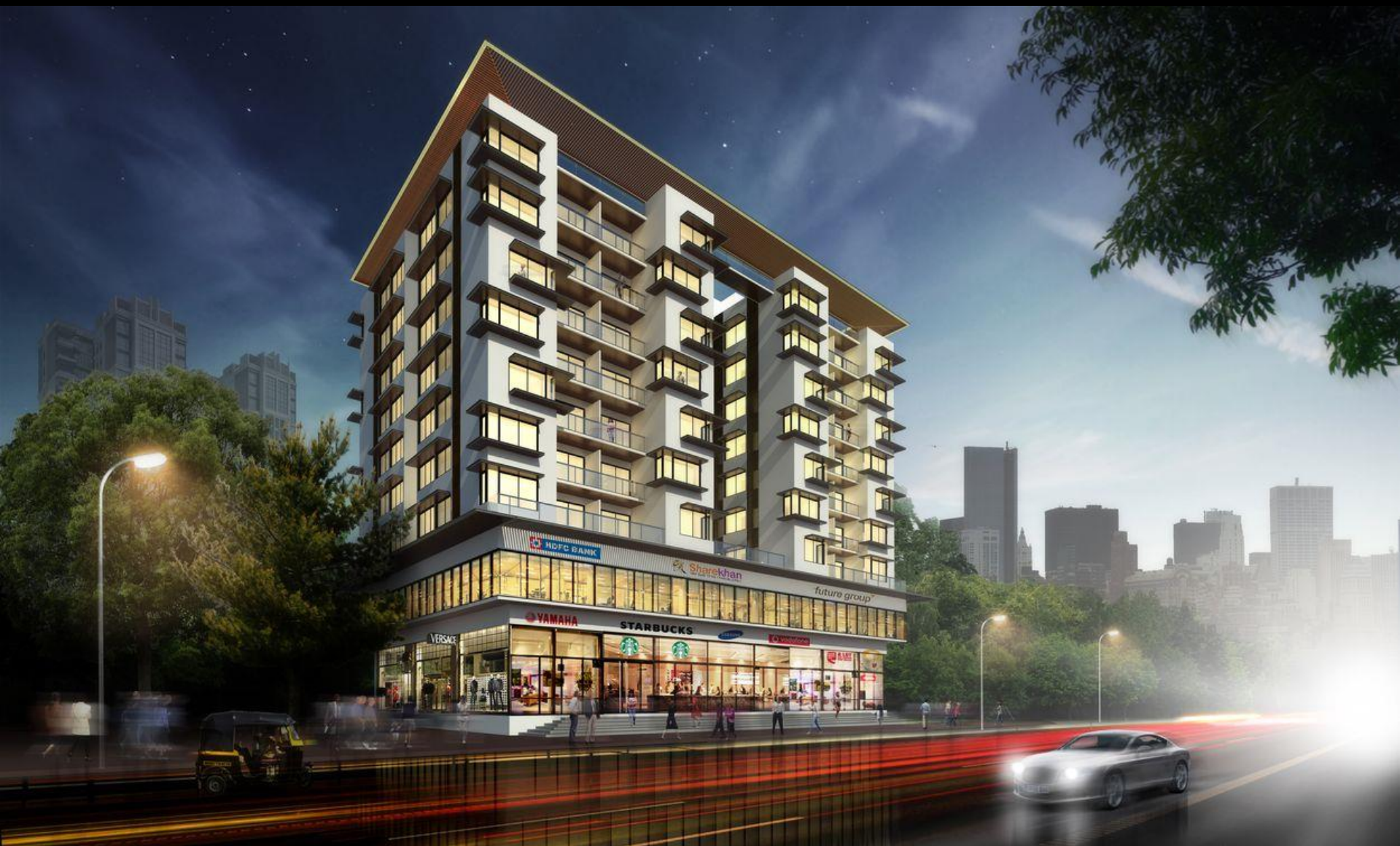
Karmaa Pinnacle Night View