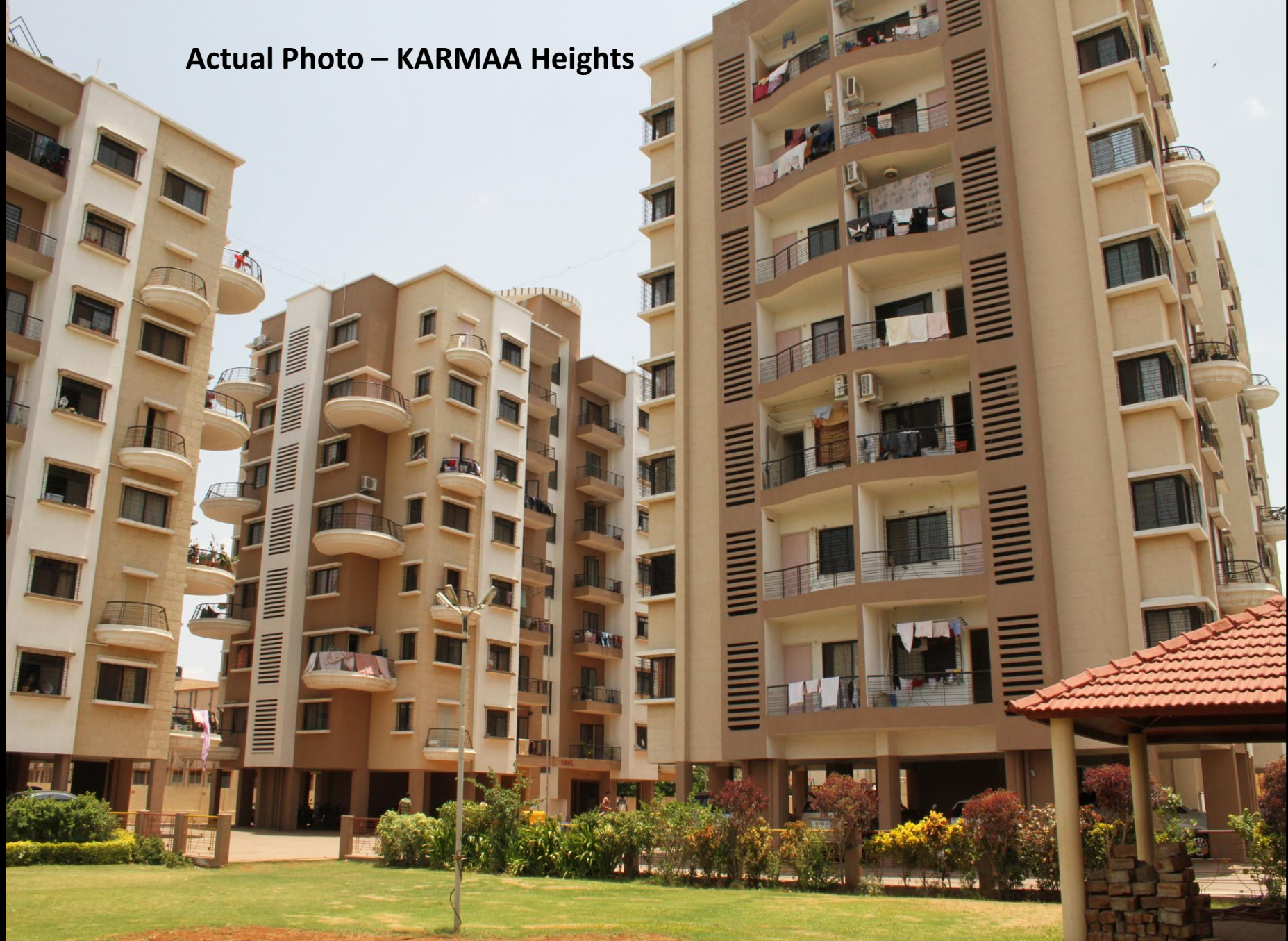
Actual Photo – KARMAA Heights