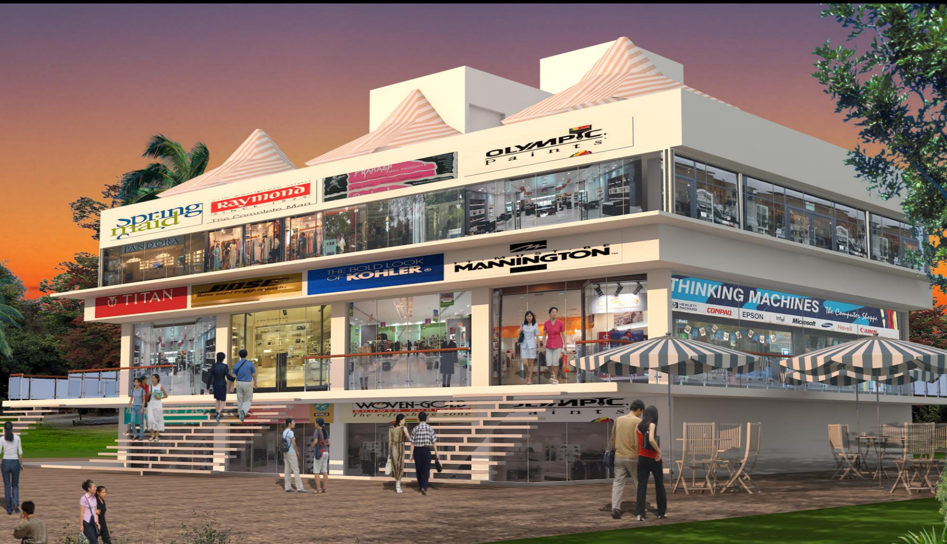
Karmaa One Evening View