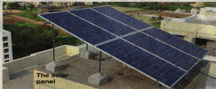
The solar panel

The uniqueness of this project is its eco-friendly characteristic. The lighting for the common areas is powered by windmills and solar panels located in the premises keeping in mind