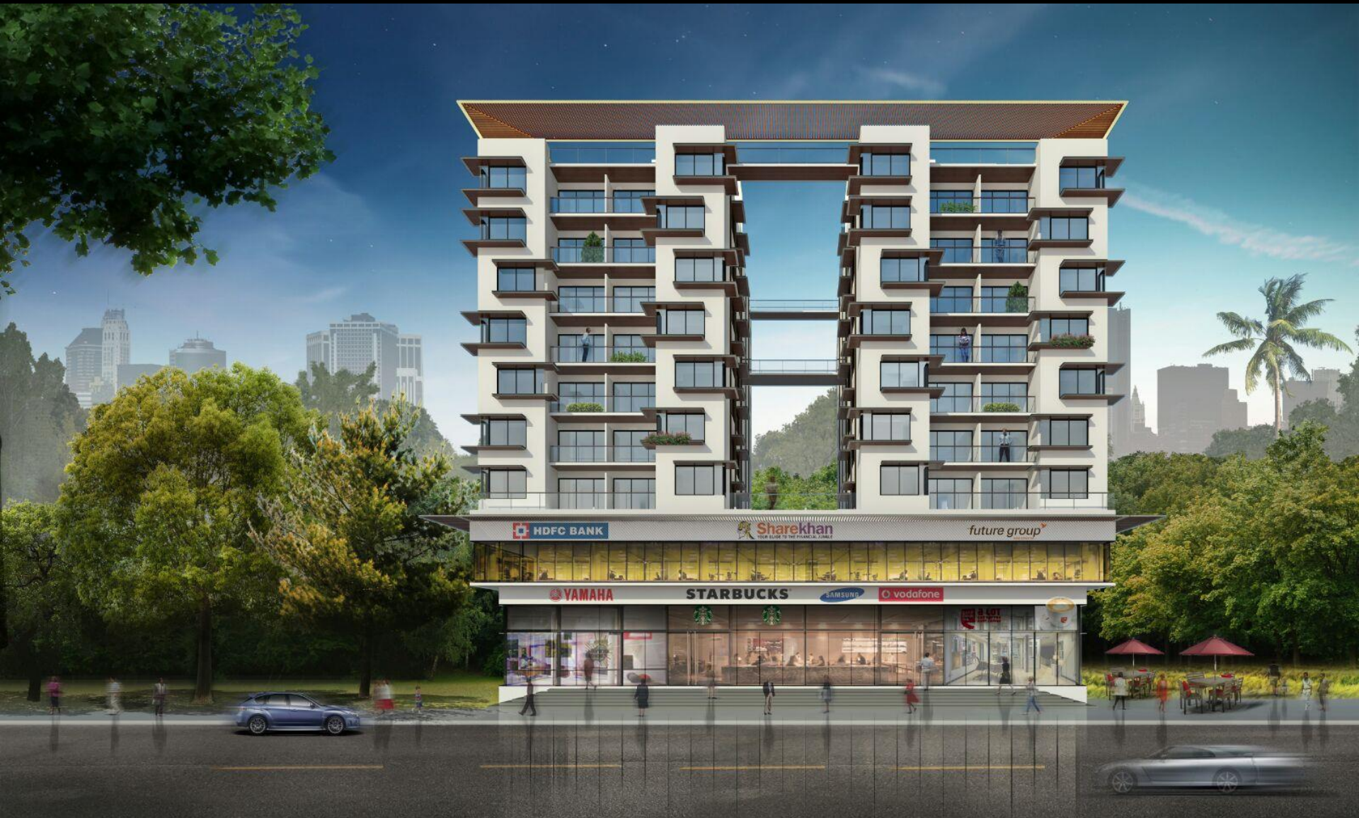
Karmaa Pinnacle Day View