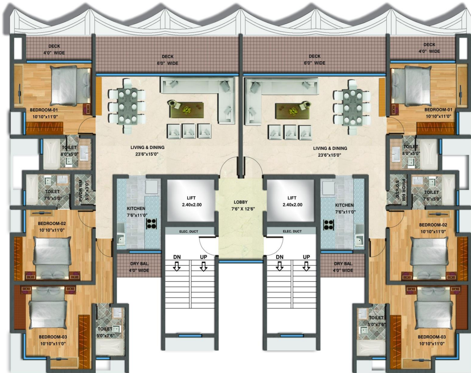
TOWER 3 TYPICAL FLOOR PLAN