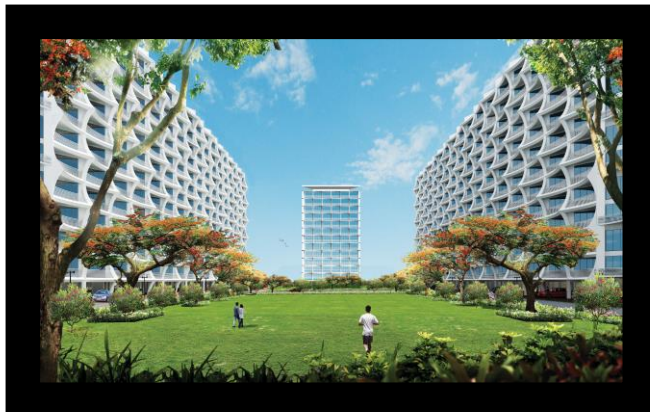
KARMAA Galaxy - 2013