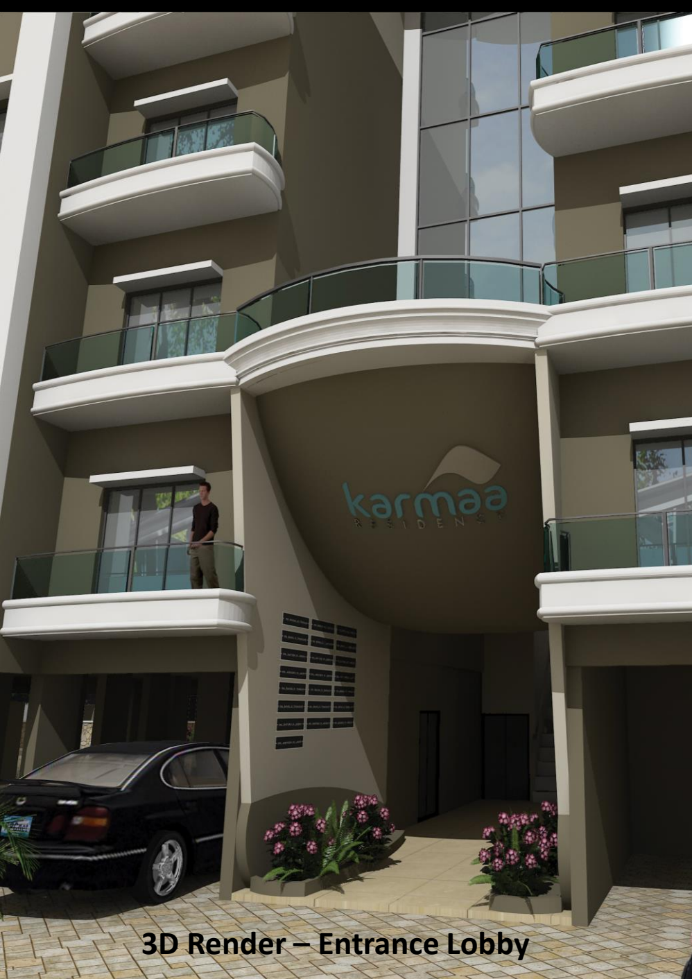
3D Render – Entrance Lobby