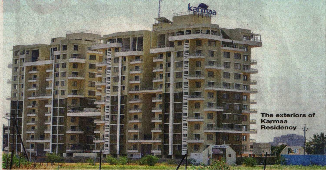
The exteriors of Karmaa Residency