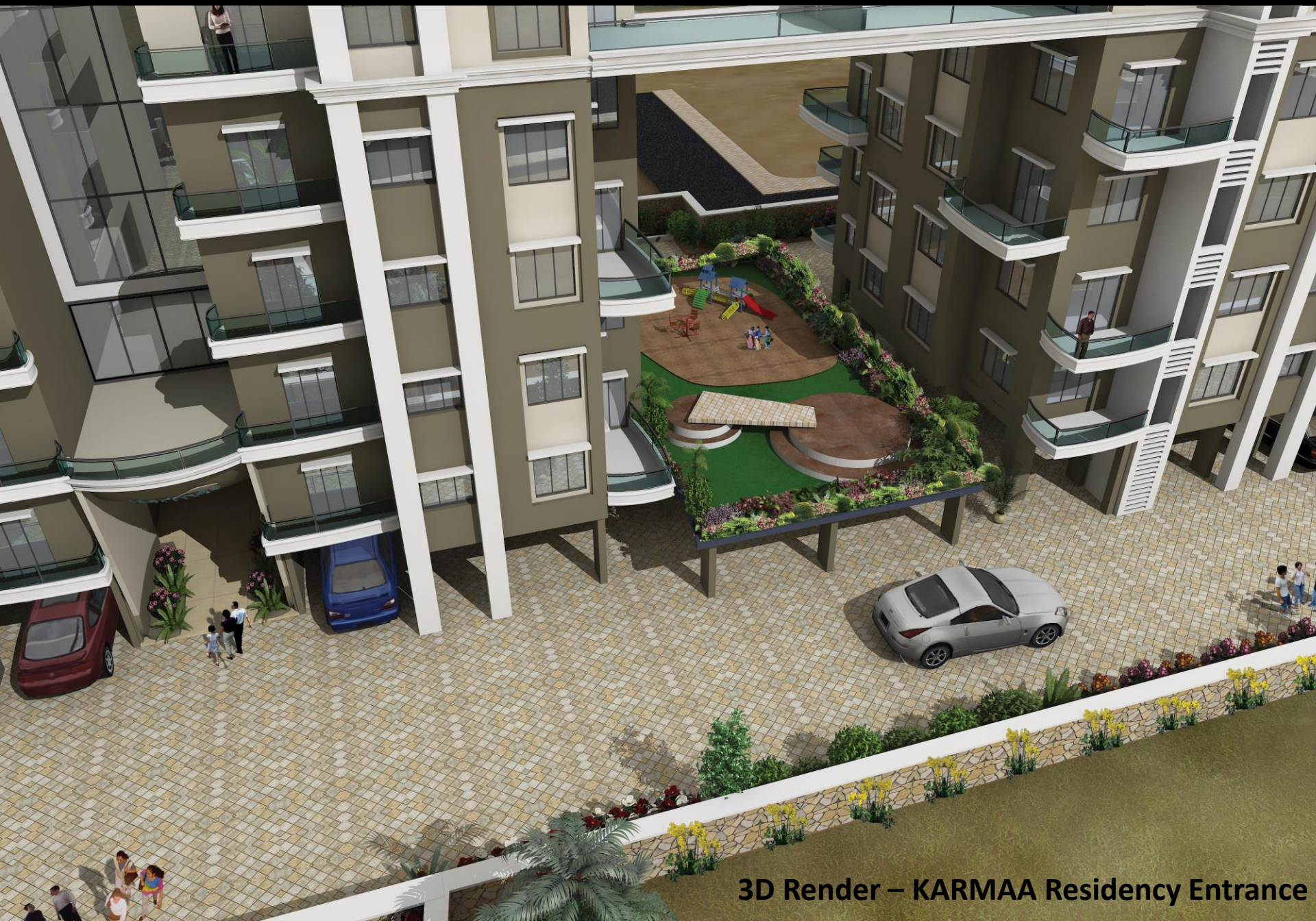
3D Render – KARMAA Residency Entrance