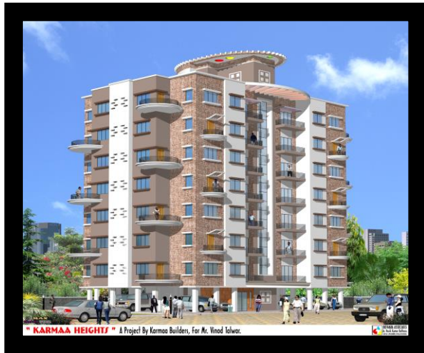
KARMAA Heights - 2007