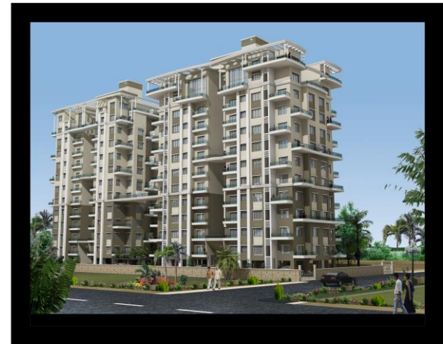
KARMAA Residency - 2011