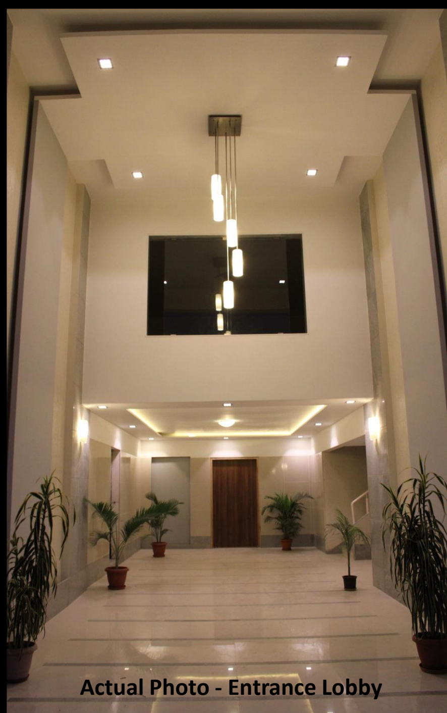
Actual Photo - Entrance Lobby