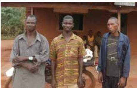
Boyawaza Clinic in Congo

In addition to our ongoing partnerships with Feed My Starving Children, Salvation Army, Ralph Reeder Food Shelf, and other ministries, this year we had exciting developments in two key partnerships: First Covenant Minneapolis Homeless Shelter and Living Hope Ministries. We were able to strengthen our commitment to these ministry partners as we focused additional human and financial resources toward the mission of these important urban service ministries. In both cases, we saw an increase in Salem's participation as folks served meals and spent time with residents at the Homeless Shelter, and as they joined Living Hope Ministries in the renovation of significantly expanded ministry space.