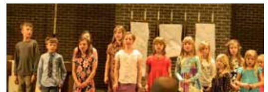
Bible Brainiacs Musical