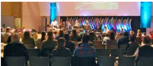
Contemporary Worship on Sundays