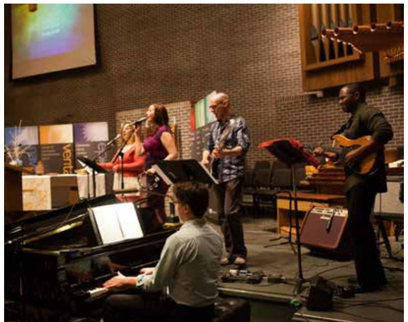
Morning worship at the Northwest Conference Annual Meeting