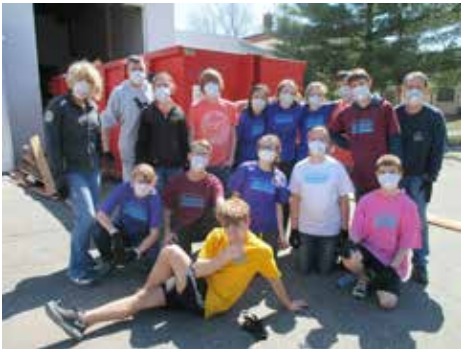
MOVE service project at Living Hope Ministries