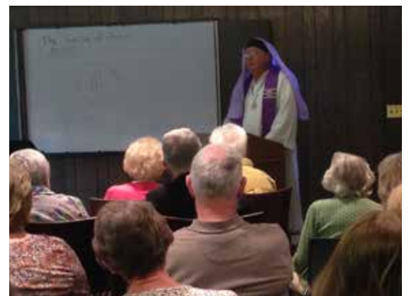
World of Jesus Class offered in June 2015