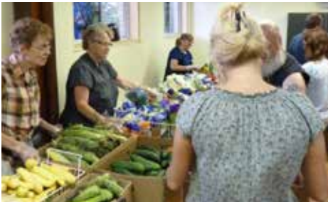
Mana Market at Fridley Covenant Church

Last summer saw a group of Senior High students encounter God in the beauty of the wilderness on a Boundary Waters canoe adventure through Adventurous Christians. During the school year, both Middle School and Senior High students dived into God's Word to learn about God's love and amazing plans for those who follow him. Excitement built as we successfully completed our CHIC fundraising efforts (thank you, CHIC Auction team and donors!) and signed up 39 students and 14 adults to head to Knoxville in July. I worked with both the Confirmation team and the Youth Ministry Team toward continuous improvement and focus on our ministry objectives in those areas.