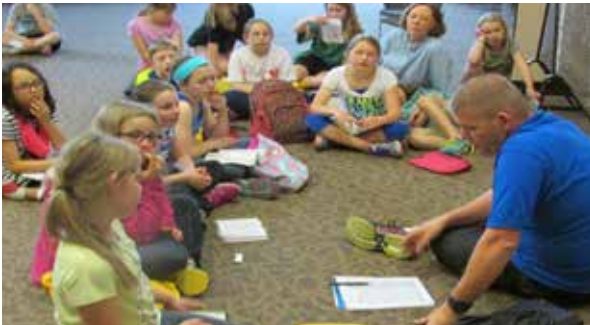
AWANA Clubs at Salem

Just in time for the start of fall programming, and with thanks to numerous volunteers and financial contributors, we were able to move into our newly renovated nursery space. Fresh paint, new carpet, new furnishings and toys, as well as some decorative painting have created a fresh, inviting space for the youngest among us. The changes in our Nursery have proven beneficial for our Sunday morning and Wednesday evening ministries as well as been appreciated by our MOPS participants. What a wonderful space in which our young children are cared for and shown the love of Christ.