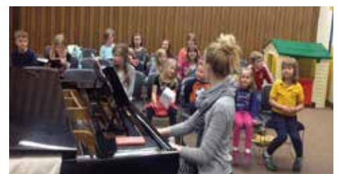
Praise Singers Rehearsal