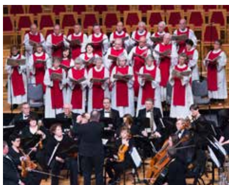
Sanctuary Choir at Wooddale Choral Festival

The Music Staff is grateful to you—the Salem congregation—and the pastoral staff for their support and encouragement throughout the year. It is a privilege and joy to be in musical ministry with you.