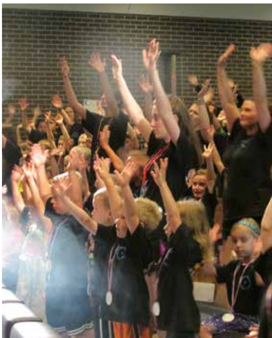
Opening Worship time at Vacation Bible School 2015

Through the partnership of a task force of Salem individuals and web design team, and made possible by contributions to our Capital Campaign, we are in the process of developing a new website. We are excited about evaluating, planning, and implementing more effective means of communicating the vision and ministries of Salem to people who already attend and to those who might be looking for a church home. There are so many wonderful things happening here and we want to share the great news!