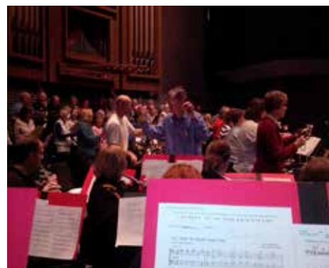
Christmas Concert Rehearsal