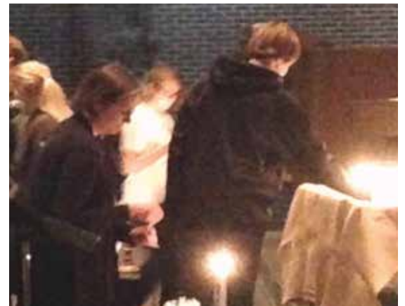
Advent Prayer Service