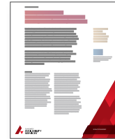
Assurance CM Solution Brief