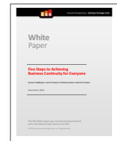
5 Steps to Achieving Business Continuity for Everyone