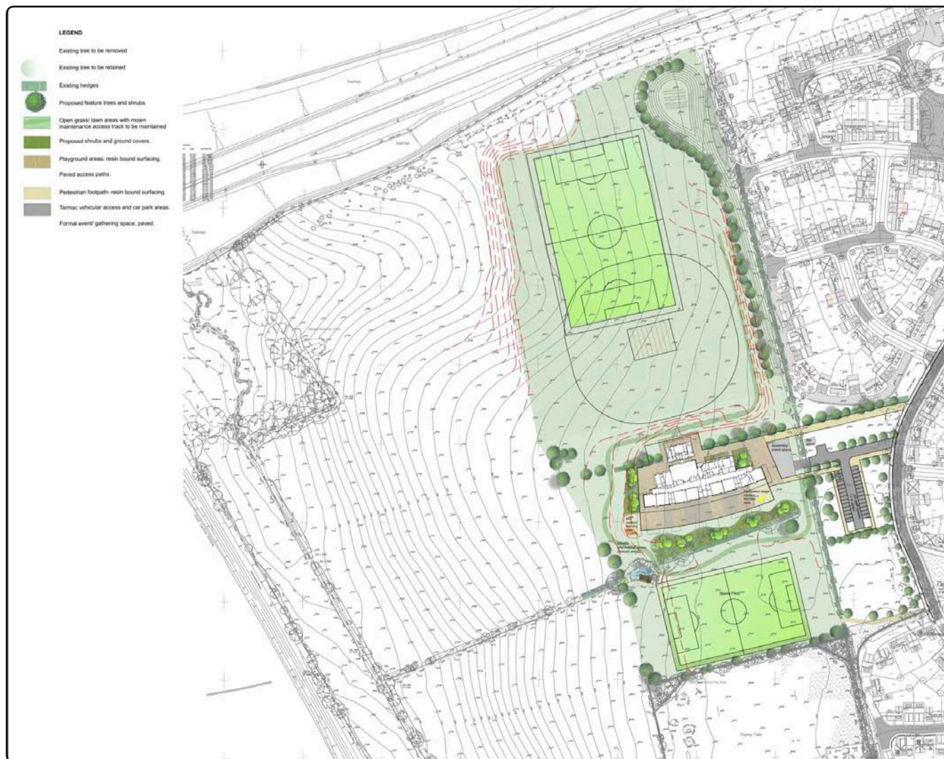
Fig 2: Proposed site of the new school