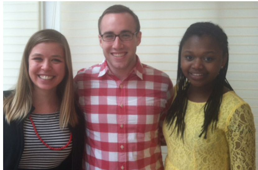
AU students gather for a college student luncheon after worship.

Our city is growing younger and more diverse, while our congregation does not reflect these demographic shifts. If we are to sustain NPC for years to come, we must attract a younger and more diverse membership – more reflective of our area. To do this, we must be able to meet the needs and support the spiritual growth of students, young families, and young adults from a variety of backgrounds.