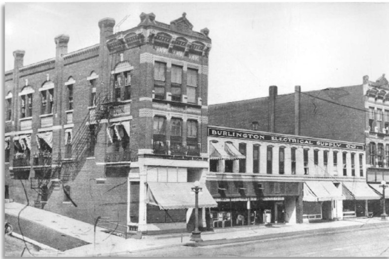
Above: Photograph of the Bookend Buildings as home to Burlington Electrical Supply Co. around 1920.