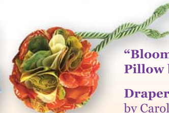
"Bloom" Decorator Pillow by Amber Webb