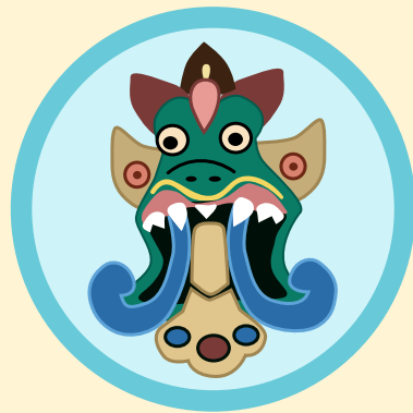
A dragon from the Sri Mariamman Temple

Imagine walking on hot coals in your bare feet! That's exactly what a Hindu priest did today at a fire-walking ceremony called Thimithi. It was held at the Sri Mariamman Temple in Chinatown—one of the oldest and most important temples in Singapore. And, Diary, you should've seen the roof—there were hundreds of gods and goddesses and animals standing on a turquoise pyramid! They were all painted and gilded with gold, and almost as big as real people. I could have looked at them all day.