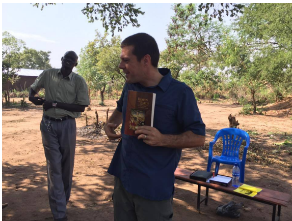
Teaching in Ethiopia

And the angel said to them, "Fear not, for behold, I bring you good news of great joy that will be for all the people. For unto you is born this day in the city of David a Savior, who is Christ the Lord." Luke 2:10,11