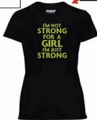
Black Women's T-Shirt $30