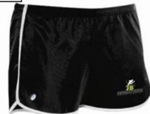
Black Women's Shorts $35