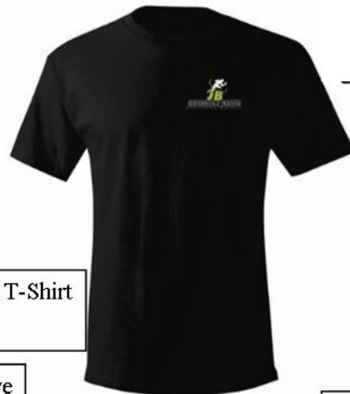
Black Men's T-Shirt $30