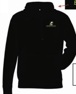
Black Hoodie $60