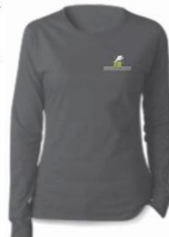
Grey Women's Long Sleeve $35