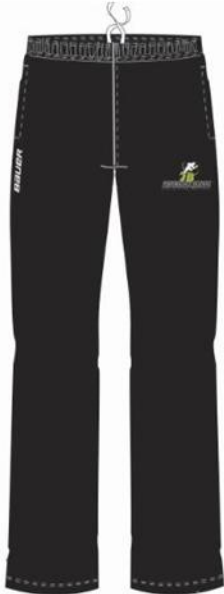
Black Bauer Pants $50