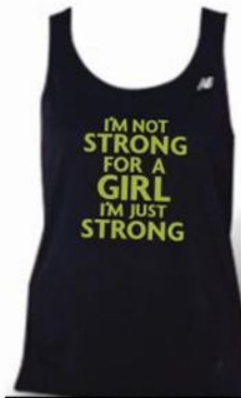
Black Women's Tank $35