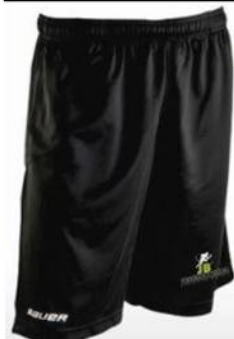
Black Men's Shorts $35