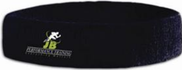
Black Headband $25