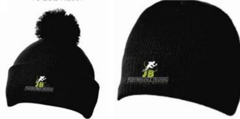
Black Toques $30