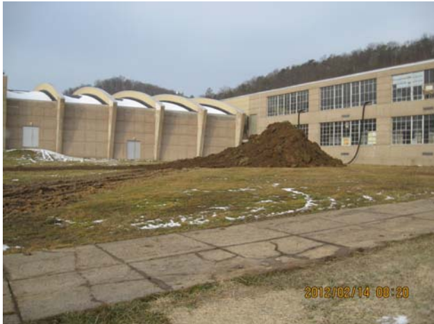
Top Soil Stripping