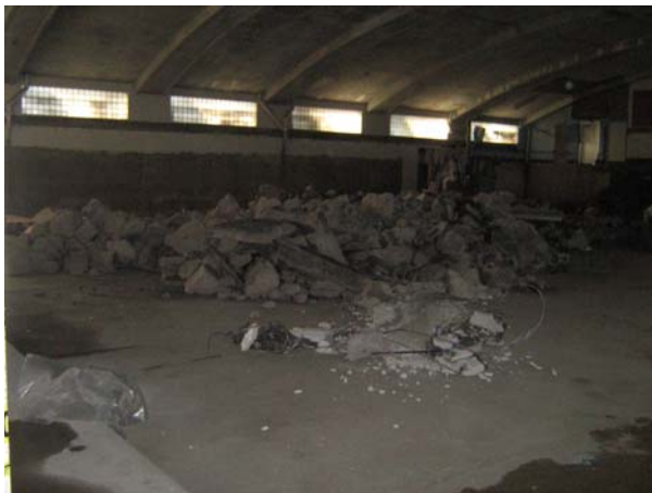
Concrete Bleacher Demolition