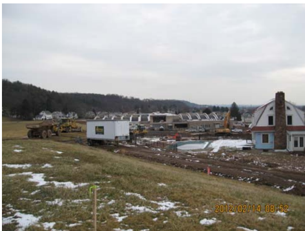
West Side of Site