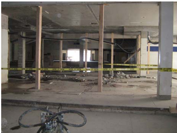
Temporary Shoring Supports