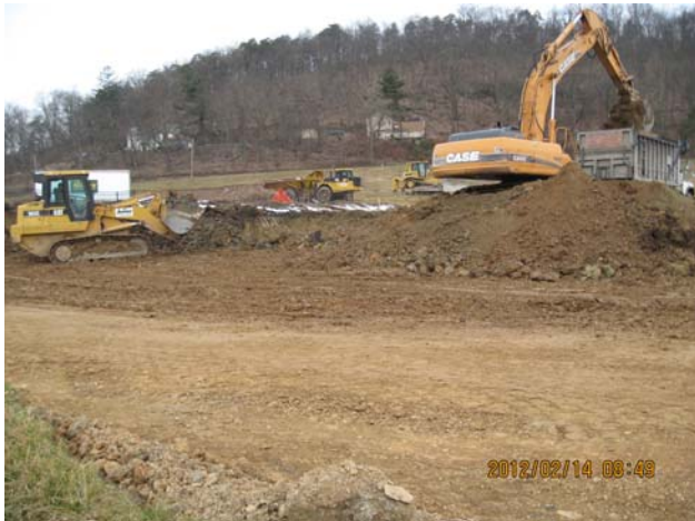
Site Clearing at West Parking Lot