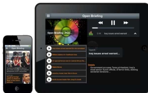
Fig 3. The Open Briefing app on an iPhone and iPad.

Finally, our press office is managed under this department as a point of contact for journalists and provides a list of Open Briefing experts available for interview.