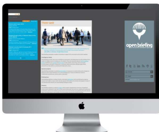
Fig 1. The think tank section of the Open Briefing website.