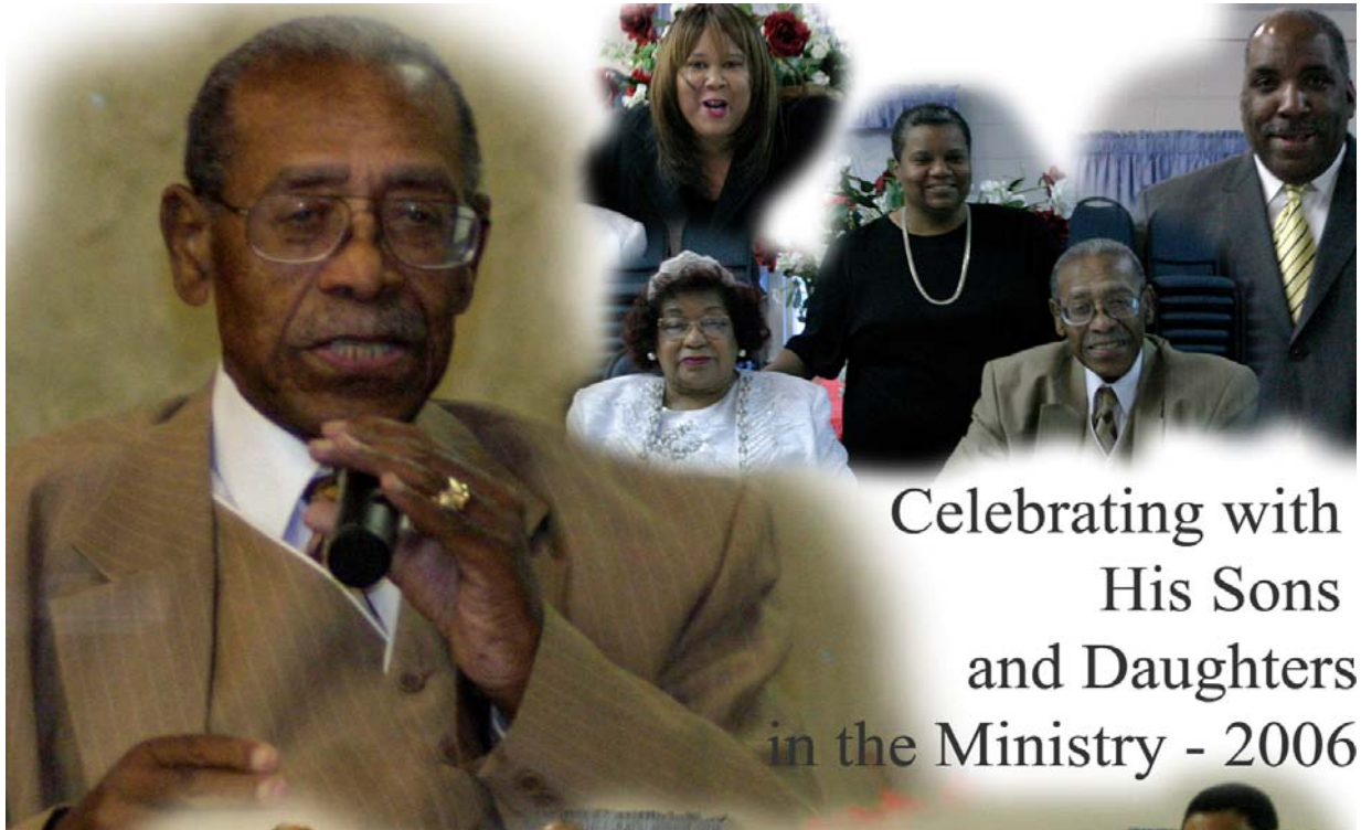
Celebrating with His Sons and Daughters in the Ministry - 2006