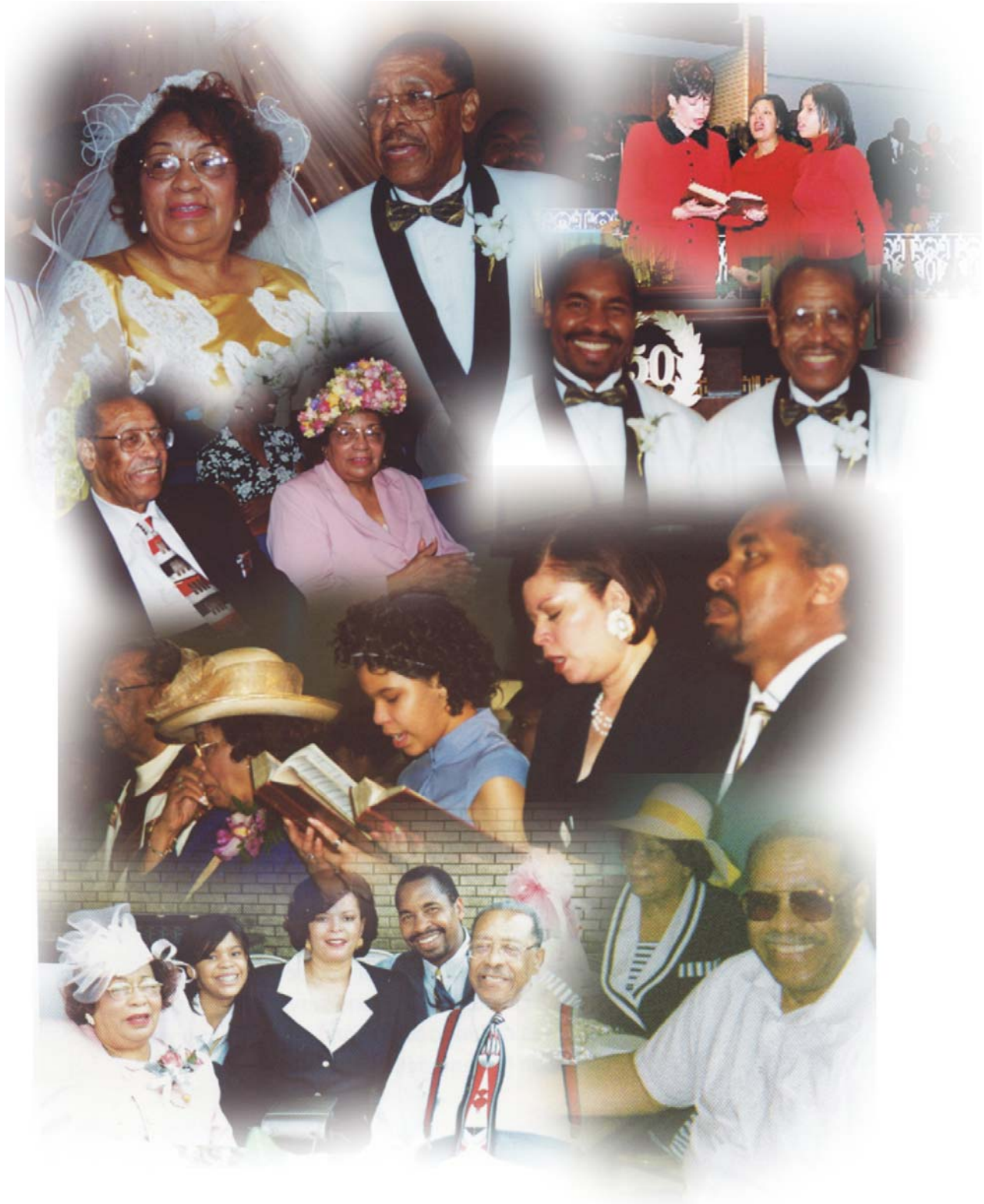
Devoted Husband, Father and Grandfather