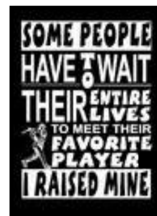
Short Sleeve T-Shirts Front Logo Only