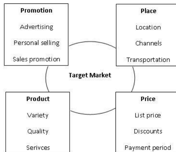
Figure 3: The four P's of the marketing mix (Kotler 2004: 58)

The marketing mix is one of the major concepts in modern marketing and is often brought up in general discussions of marketing. Marketing mix is a set of marketing tools that a company uses to pursue its marketing objectives in the target market. When a company is making decisions on marketing they generally fall into four controllable categories known as the 4 P's: product, price, place and promotion.