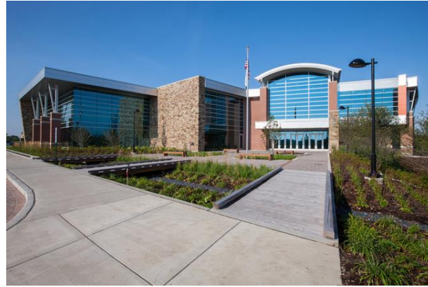
Venue: Carol Stream Rec Center Fountain View