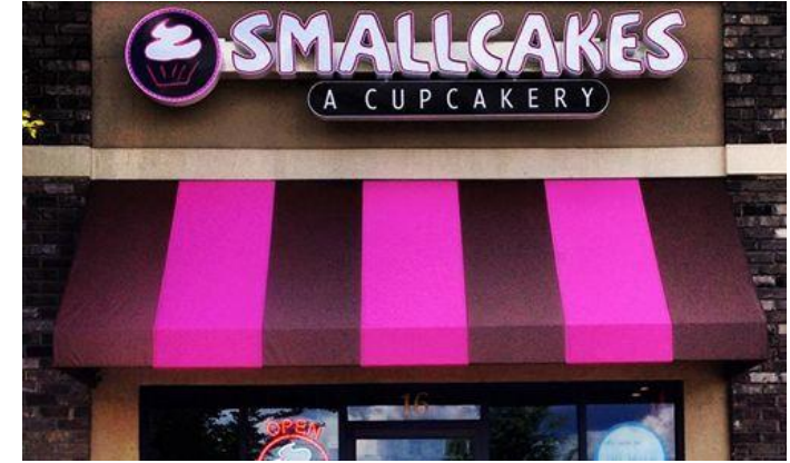
Cupcakes: Small Cakes