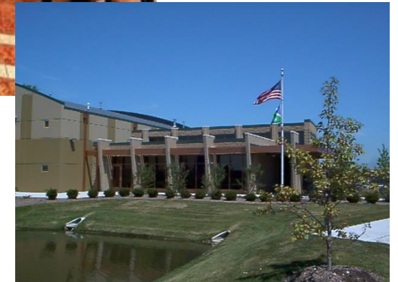
Other potential venue options not chosen: Elm Creek Apartments events room, Bolingbrook Rec Center