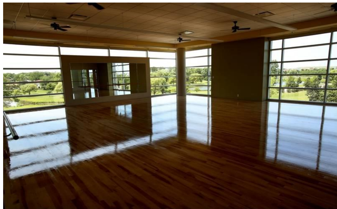
Chosen Venue: Carol Stream Rec Center Fountain View