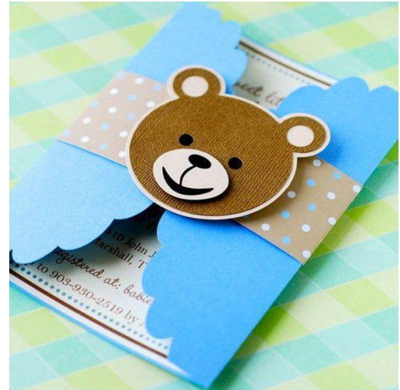
Baby blue invite gate

It was very important to have teddy bears as a focal point of the overall theme and what better way to show it! The invites will have all the concept colors and themed wording.