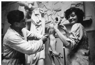
At the Royal Academy Schools 1948