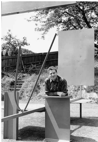
Caro and Early One Morning 1962