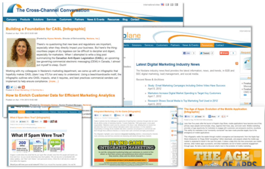
Examples of content marketing assets optimized and created, including blog posts, news stories, and infographics

As indicated above, content marketing became an essential component of Neolane’s SEO program due to its necessity in messaging, submission to third-party websites, and inbound link creation. Steps taken to drive the content marketing initiative included the following: