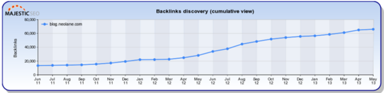
Growth of third party links to the Neolane blog via Majestic SEO