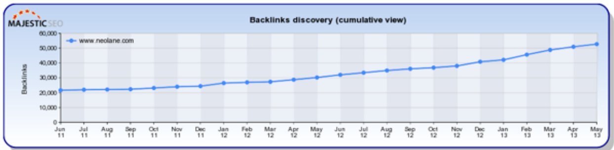
Growth of third party links to the Neolane company website via Majestic SEO

With KoMarketing Associates, Neolane achieved significantly greater organic search engine visibility through fresh, consistent content marketing initiatives based off of an expansive keyword strategy, ongoing competitive SEO analysis, and dedicated communication and analysis between organizations.