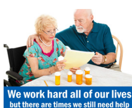
We Work Hard #3