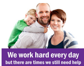
We Work Hard #1