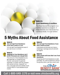
Five Myths Flyer