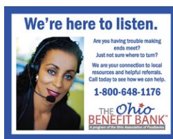
Hotline Palm Card

Our general outreach flyers promote all OBB services, including application assistance and eligibility screening. Available in bundles of 25; indicate how many bundles below.