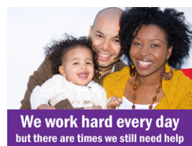
We Work Hard #2