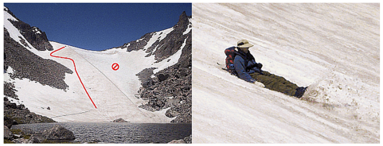
Figure 8. Safe descent route, Andrews Glacier, Rocky Mountain National Park. The small dot above the bold solid line is a party starting the 150 m vertical descent. Right (north) of the crest of the glacier the slope drops dangerously into rocks. "Bum sliding" ( sitting glissade ) is the favored mode of descent on this popular outing. Andrews Tarn is in the foreground.

■ A picture is worth a thousand words. Illustrations, pictures, are expensive to print, especially color pictures, but that is not a limitation with the word processors and inkjet printers used for final manuscripts. If it makes sense to use a picture, do so. The picture in Figure 8 would be difficult to describe in the text, and would likely require a specialized language to do so (bergschrund, cornice, crevasse, fall line, glissade, grade, talus, tarn) that would also have to be explained. Capitalize Figure in references to an image or graph in the text.