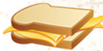
GRILLED CHEESE DELIGHT The classic sandwich with American cheese $6.99