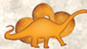
SHRIMP KENS Popcorn shrimp & Jurassic Chicken Tidbits™ $7.99