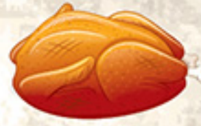
DIZZY CHICKEN 1/4 Rotisserie Chicken $7.99