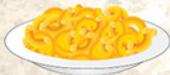
COSMO'S CHEESY MACARONI Pasta with lots of cheese $6.99