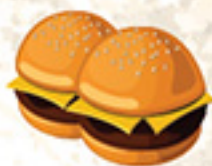
SLY'S SLIDERS Char-broiled mini burgers with American cheese $6.99