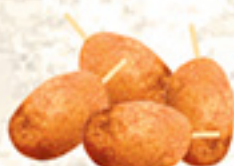
DEXTER'S CORN DOGS Mini corn dogs $6.99