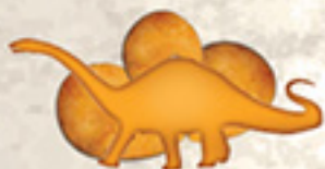
JURASSIC CHICKEN TIDBITS Dinosaur-shaped chicken $6.99