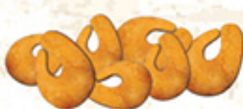
PREHISTORIC POP'N SHRIMP Popcorn shrimp $7.99