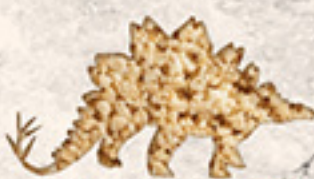
PAINT-A-DINO Paint a dinosaur-shaped Rice Krispies Treat & enjoy $4.99