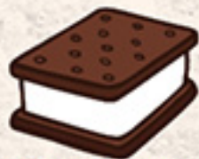
ICE AGE ICE CREAM SANDWICH A classic vanilla flavored ice cream sandwich $1.49