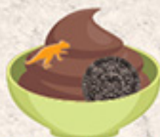
CHOCOLATE TARPIT Creamy chocolate pudding with crushed Oreo® cookies & gummy dinosaurs $2.99