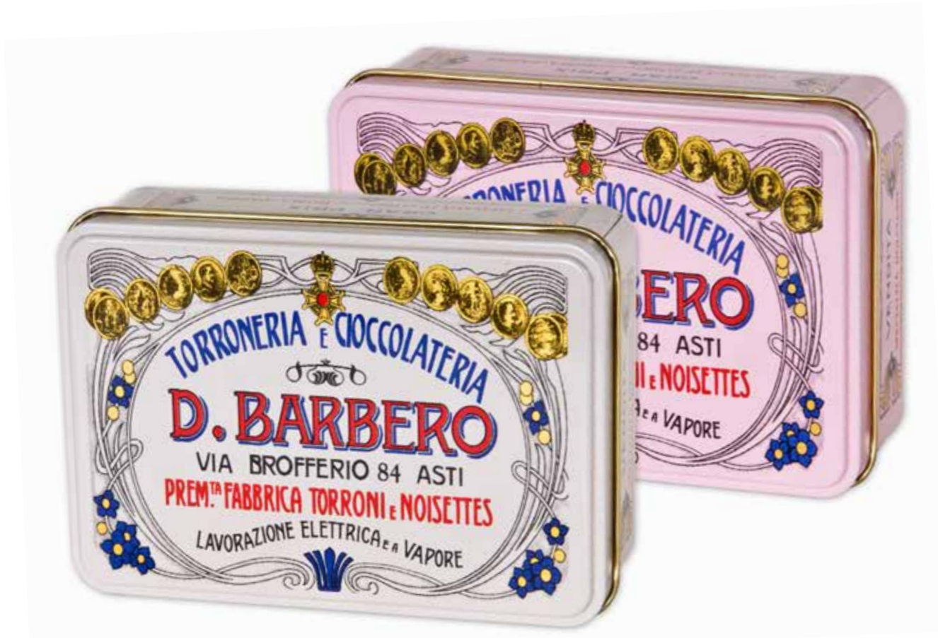
TR460 - D.Barbero Torroncini Almond Tin 12 x 100g (Pink Tin) TR461 - D.Barbero Torroncini Hazelnut Bag 12 x 100g (Cream Tin)