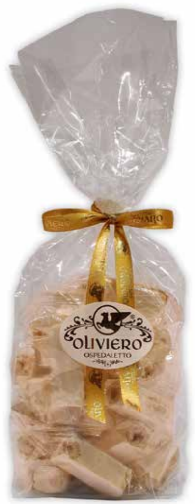
TR341 - Torroncini Bag Hazelnut 16 x 200g