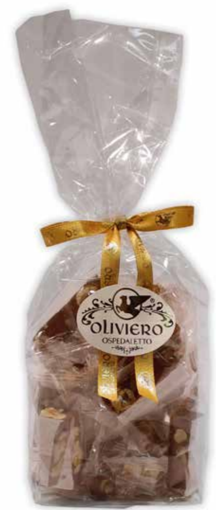
TR343 - Torroncini Bag Chocolate 16 x 200g