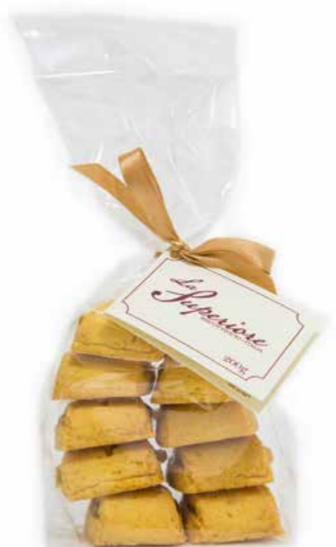
BS425 - Bauletti (Lemon Marmalade Filling) 12 x 200g