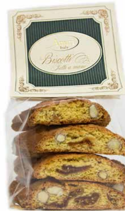
BS372 - Cantucci Fig & Almond 12 x 200g