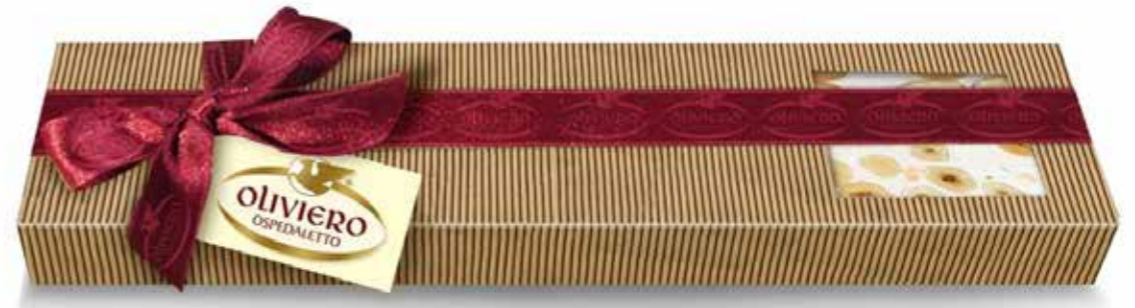
TR157 - Soft Hazelnut Corrugated Box 12 x 300g