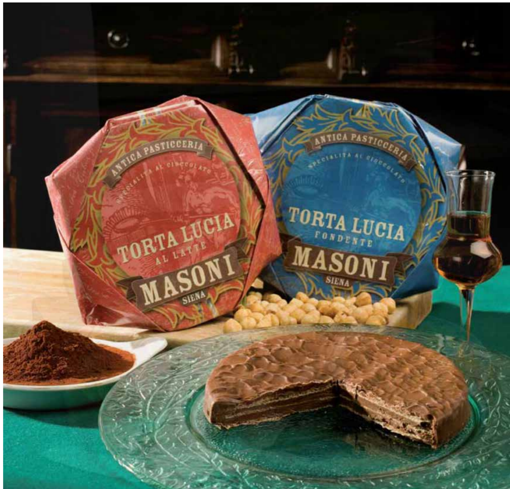
CA130 - Torta Lucia (Dark Chocolate) 12 x 400g CA131 - Torta Lucia (Milk Chocolate) 12 x 400g