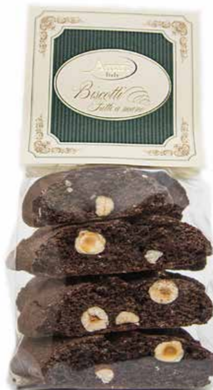
BS371 - Cantucci Chocolate 12 x 200g