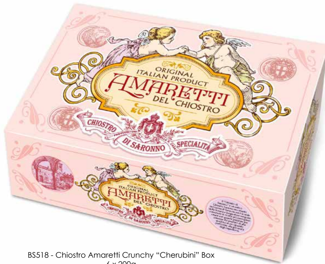
BS518 - Chiostro Amaretti Crunchy "Cherubini" Box 6 x 200g