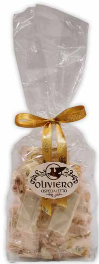
TR342 - Torroncini Bag Pistachio 16 x 200g