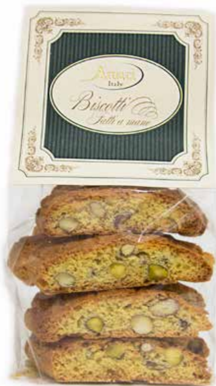
BS373 - Cantucci Pistachio & Almond 12 x 200g