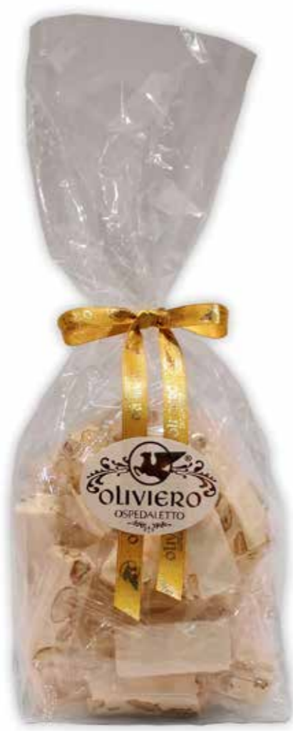
TR340 - Torroncini Bag Almond 16 x 200g

Individually wrapped bite-sized pieces of Italian nougat