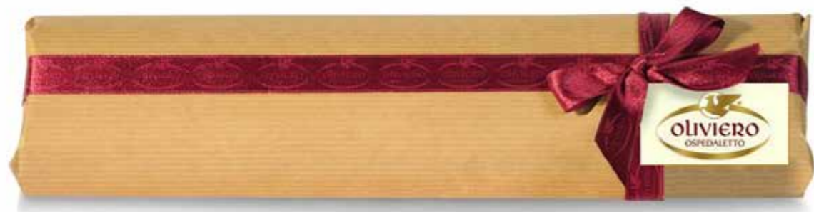
TR152 - Hard Almond Hand-Wrapped 12 x 220g