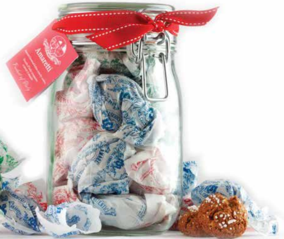
BS515 - Chiostro Amaretti Crunchy Glass Jar 6 x 175g