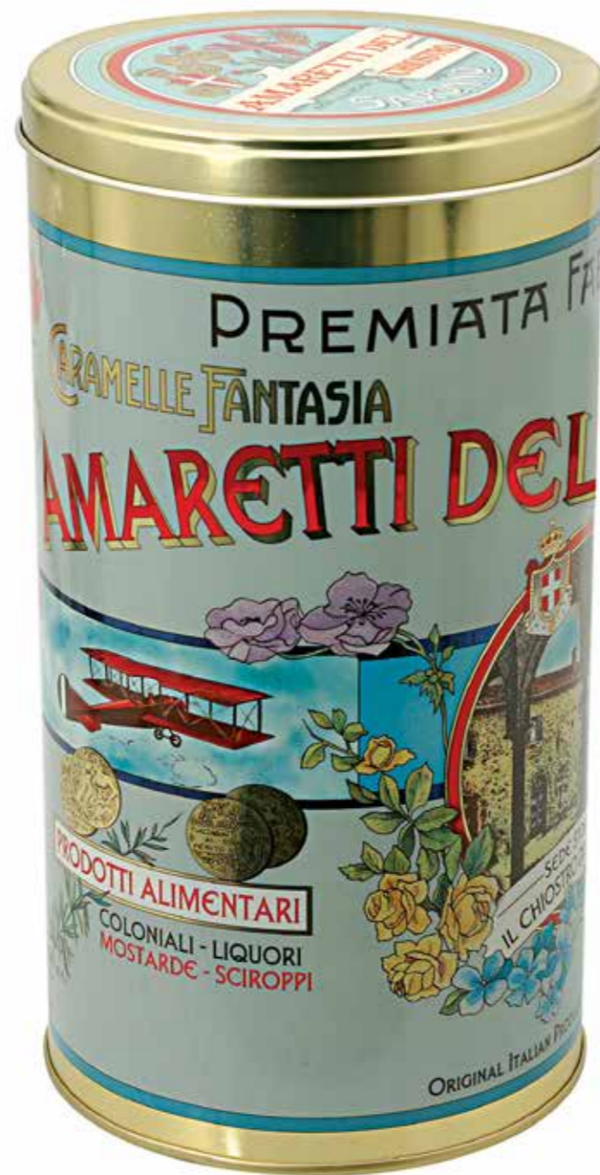
BS512 - Chiostro Amaretti Crunchy Retro Tin 6 x 210g