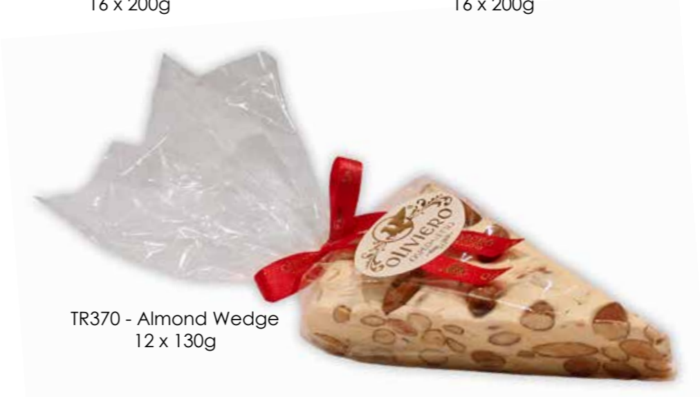
TR370 - Almond Wedge 12 x 130g