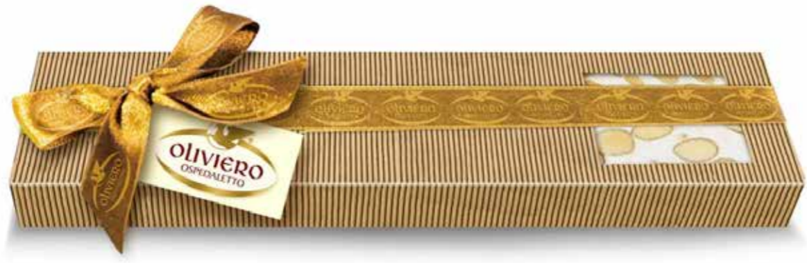
TR156 - Soft Almond Corrugated Box 12 x 300g