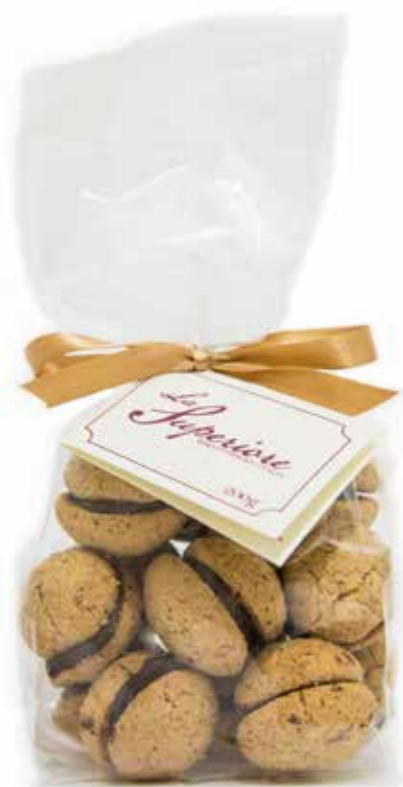
BS420 - Baci Di Dama (Chocolate Filling) 12 x 200g