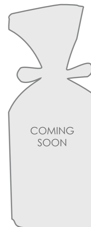
BS426 - Bauletti (Strawberry Marmalade Filling) 12 x 200g