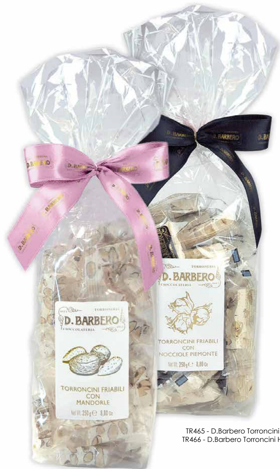
TR465 - D.Barbero Torroncini Almond Bag 15 x 200g (Pink Ribbon) TR466 - D.Barbero Torroncini Hazelnut Bag 15 x 200g (Black Ribbon)