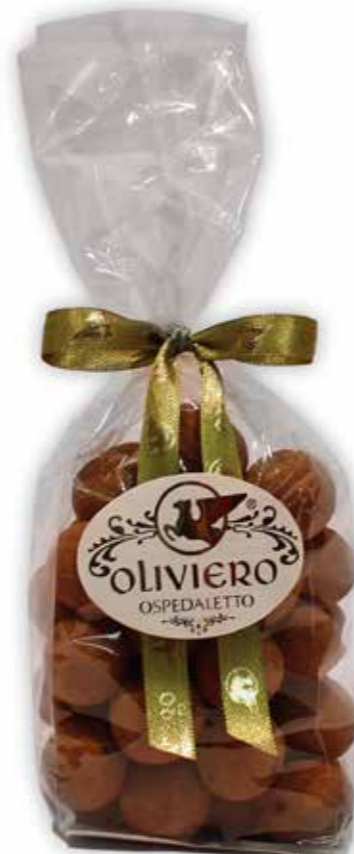
TR361 - Tartufate Hazelnuts Bag (Choc Dipped & Powder Coated) 16 x 200g