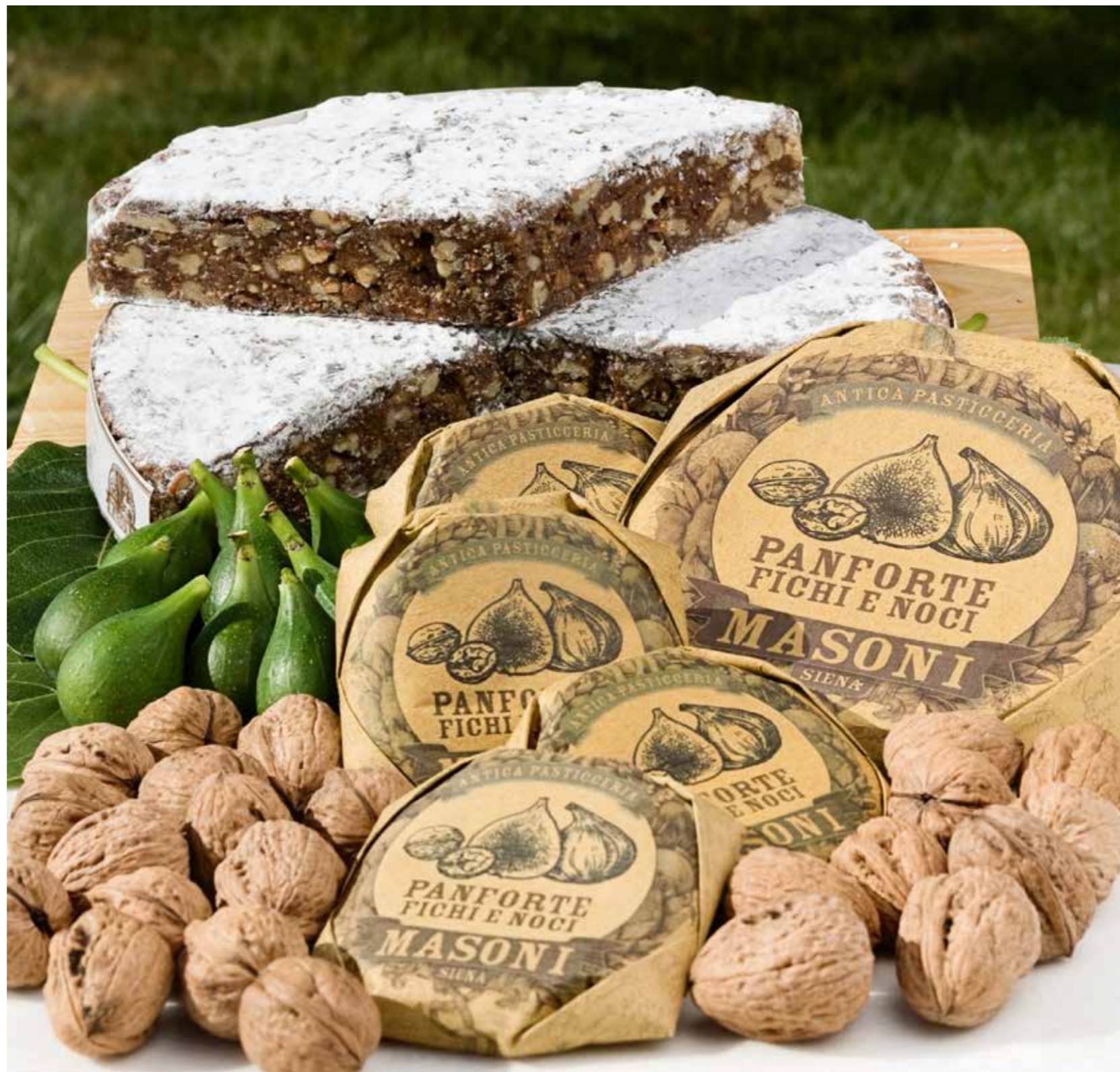
CA110 - Panforte Figs & Walnuts 36 x 100g CA111 - Panforte Figs & Walnuts 24 x 250g CA112 - Panforte Figs & Walnuts 18 x 450g