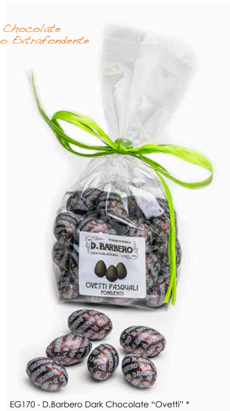
EG170 - D.Barbero Dark Chocolate "Ovetti" * 12 x 200g