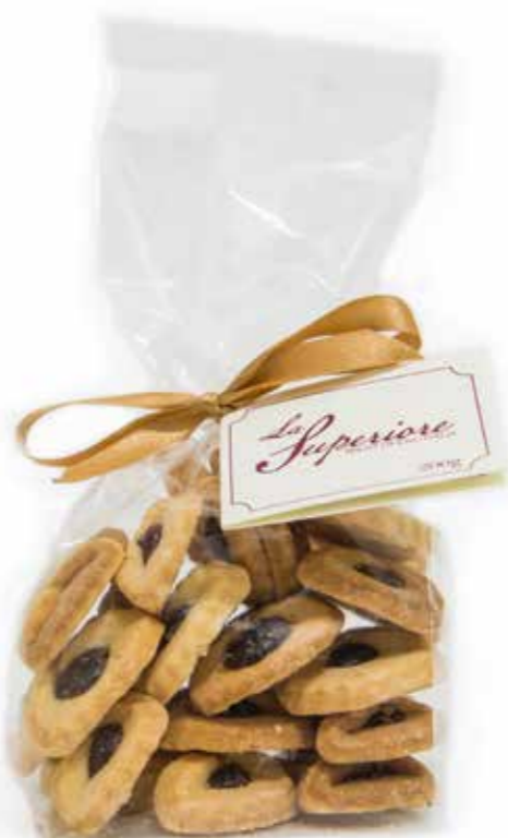
BS422 - Fiocchi (Marmalade Filling) 12 x 200g