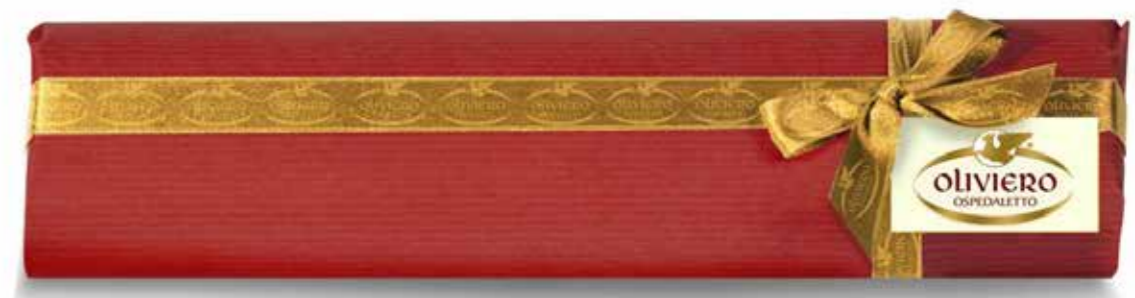
TR153 - Chocolate Hand-Wrapped 12 x 220g