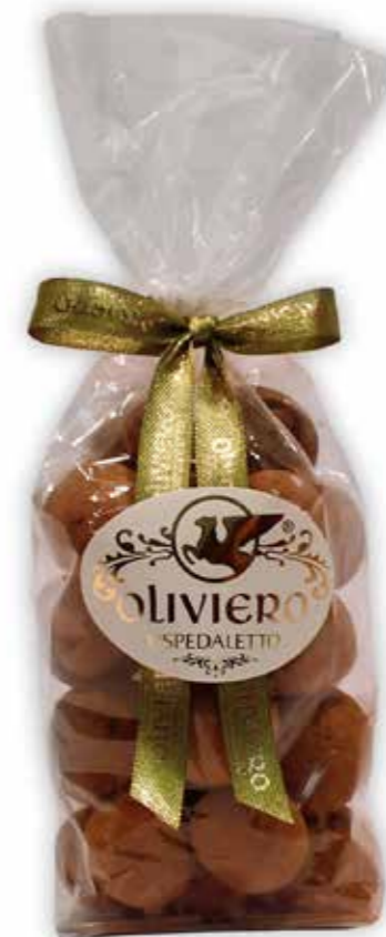
TR362 - Tartufate Cherry Bag (Choc Dipped & Powder Coated) 16 x 200g