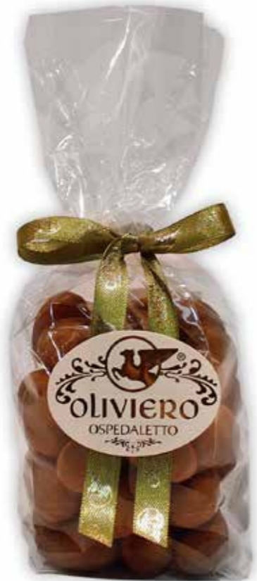
TR360 - Tartufate Almond Bag (Choc Dipped & Powder Coated) 16 x 200g

Dipped in Italian chocolate and coated in cocoa powder