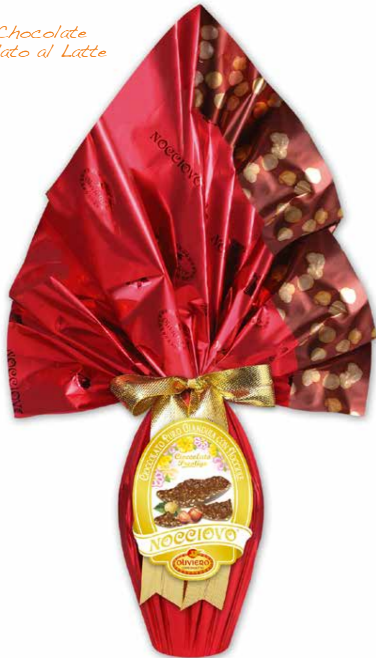
EG100 - Oliviero Milk Chocolate/Hazelnut "Nocciovo" * 12 x 300g