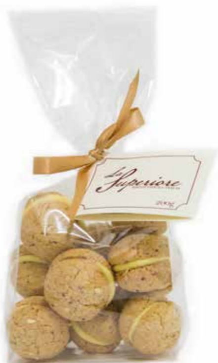
BS421 - Baci Di Dama (Lemon Chocolate Filling) 12 x 200g