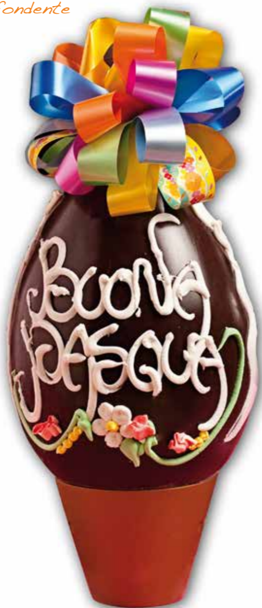
EG150 - Masoni Hand Painted "Decorato" * 6 x 350g