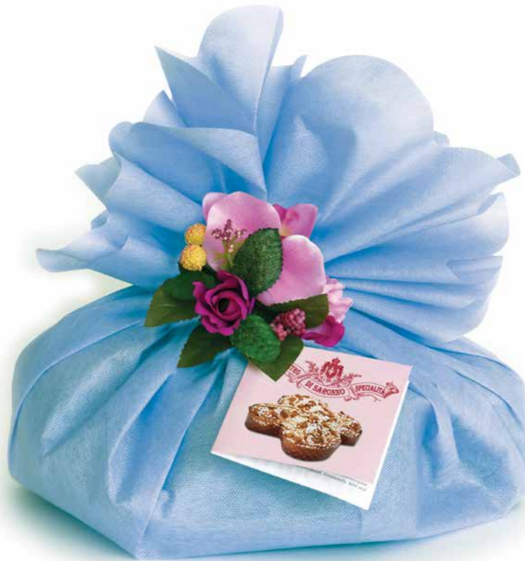
CA248 - Chiostro Colomba - Classica (Hand Wrapped) 6 x 1kg