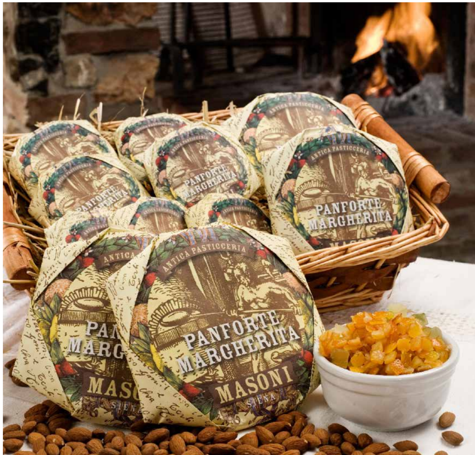
CA100 - Panforte Margherita 36 x 100g CA101 - Panforte Margherita 24 x 250g CA102 - Panforte Margherita 18 x 450g