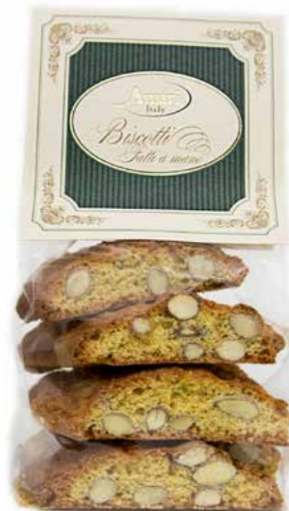
BS370 - Cantucci Almond 12 x 200g