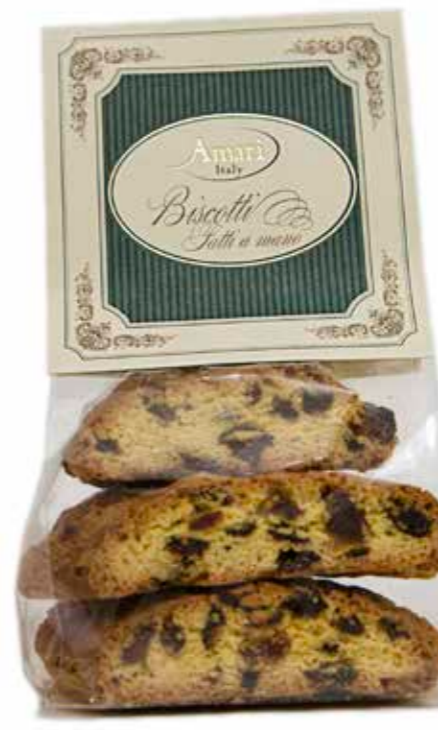
BS375 - Cantucci Raisins & Rum 12 x 200g