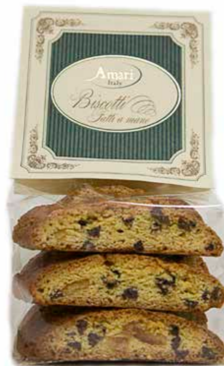
BS374 - Cantucci Orange & Chocolate 12 x 200g