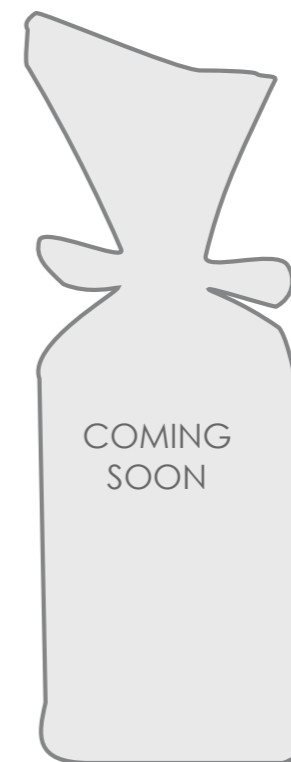
BS429 - Frollini (Chocolate Filling) 12 x 200g