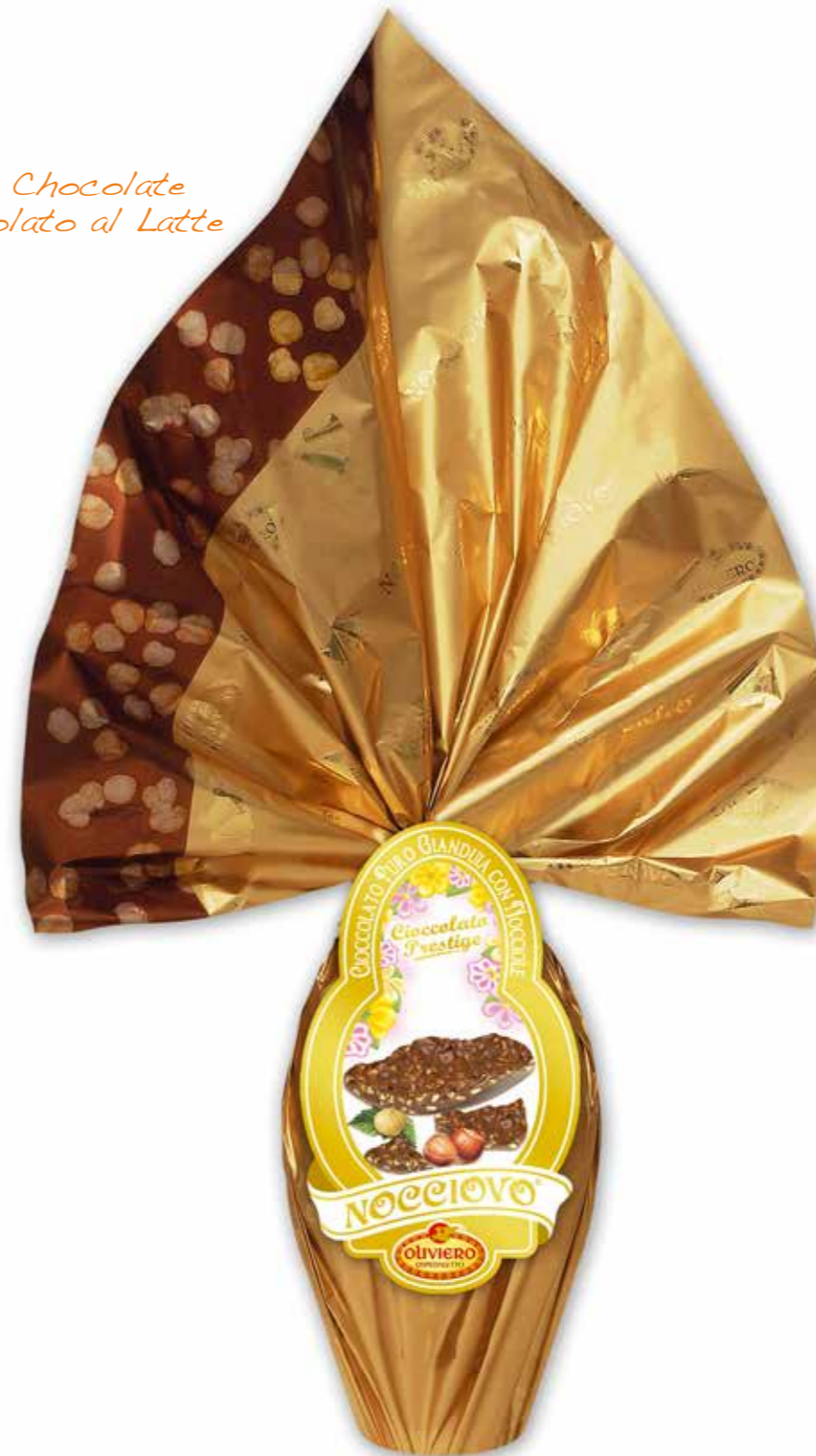
EG101 - Oliviero Milk Chocolate/Hazelnut "Nocciovo" * 8 x 450g