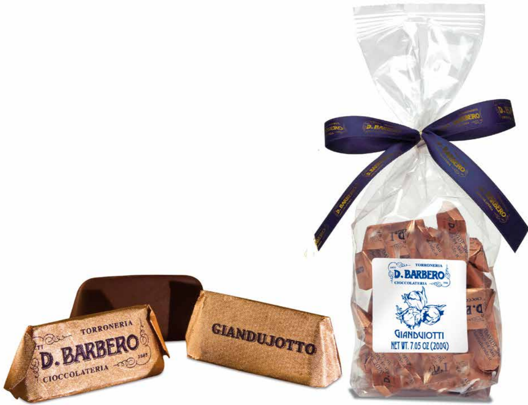
TR468 - D.Barbero Gianduiotti Bag 12 x 200g