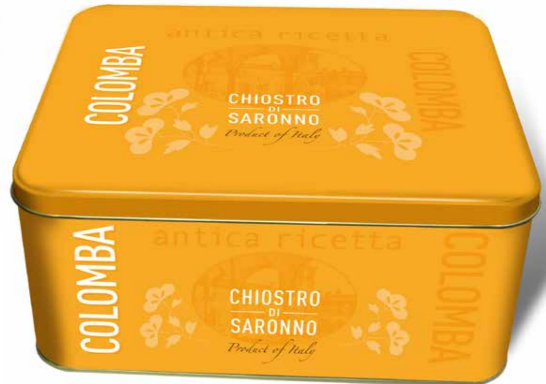
CA244 - Chiostro Colomba - Chocolate (Tin) 3 x 750g