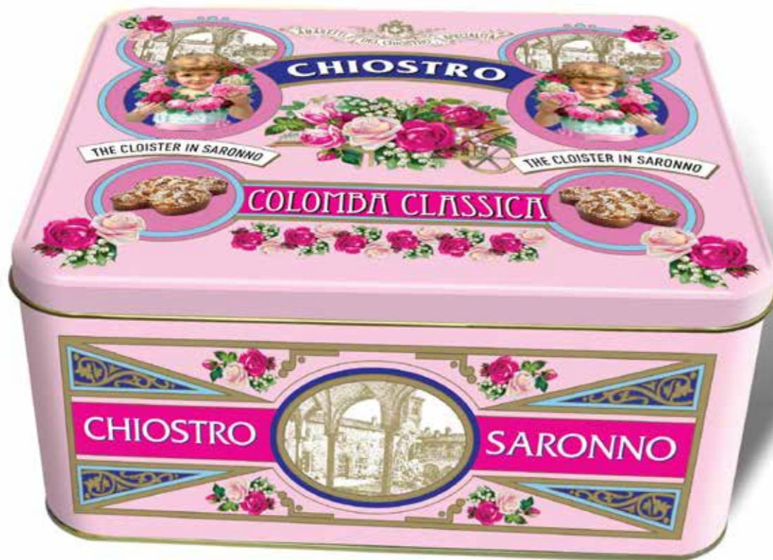
CA242 - Chiostro Colomba - Classica (Tin) 3 x 750g