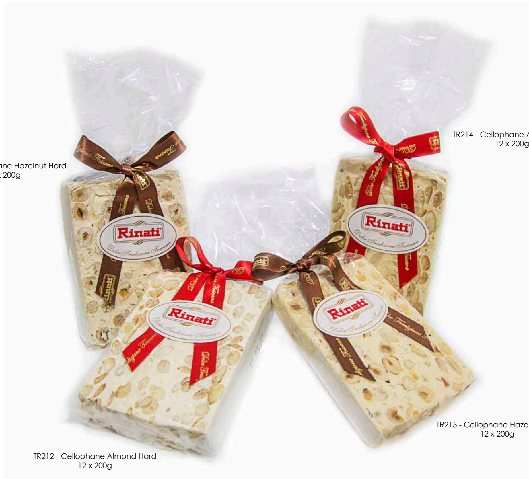
TR213 - Cellophane Hazelnut Hard 12 x 200g