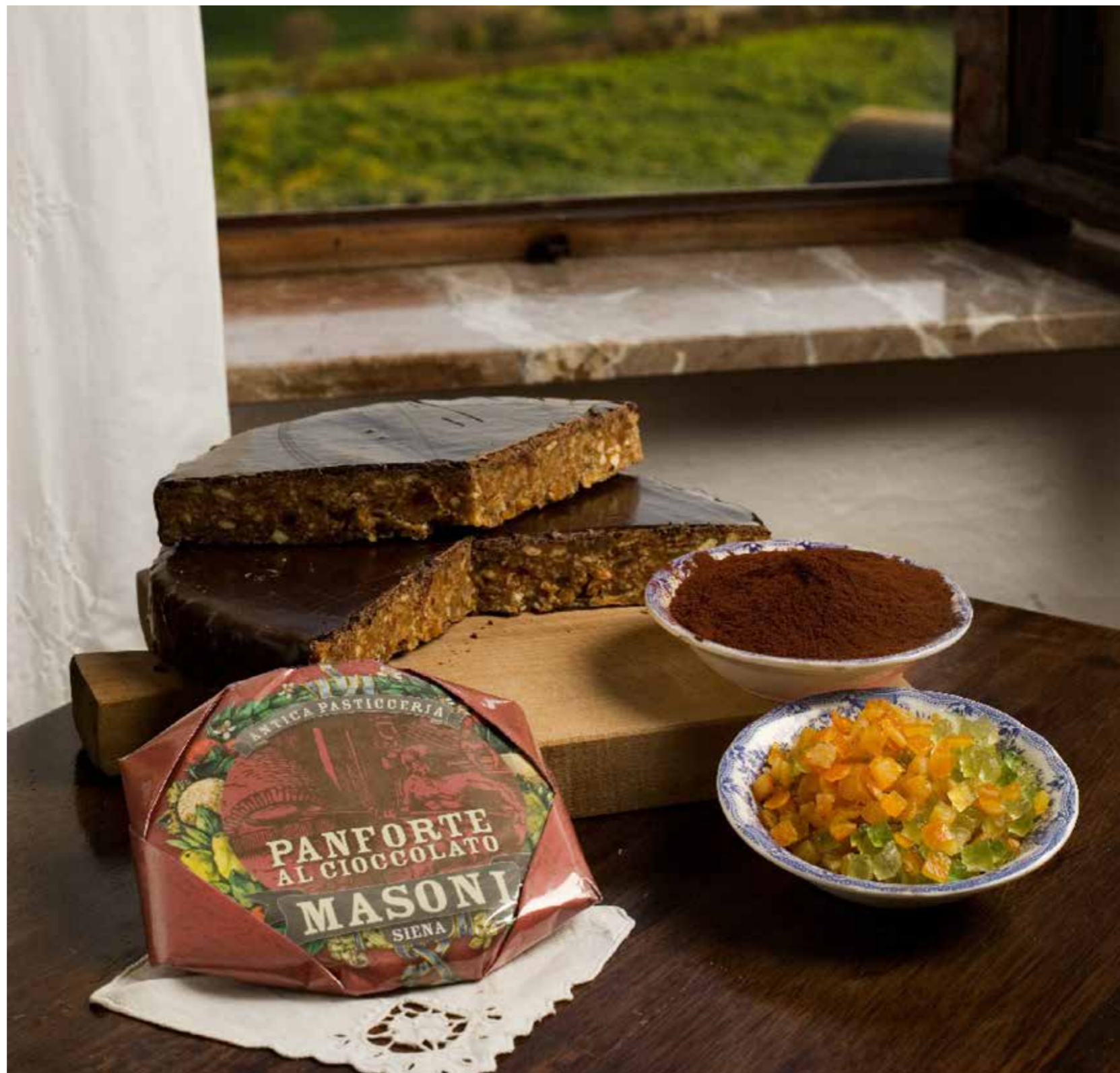
CA120 - Panforte Chocolate 18 x 450g