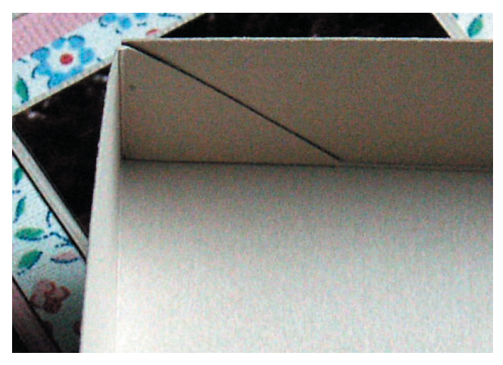
Lid inside corner